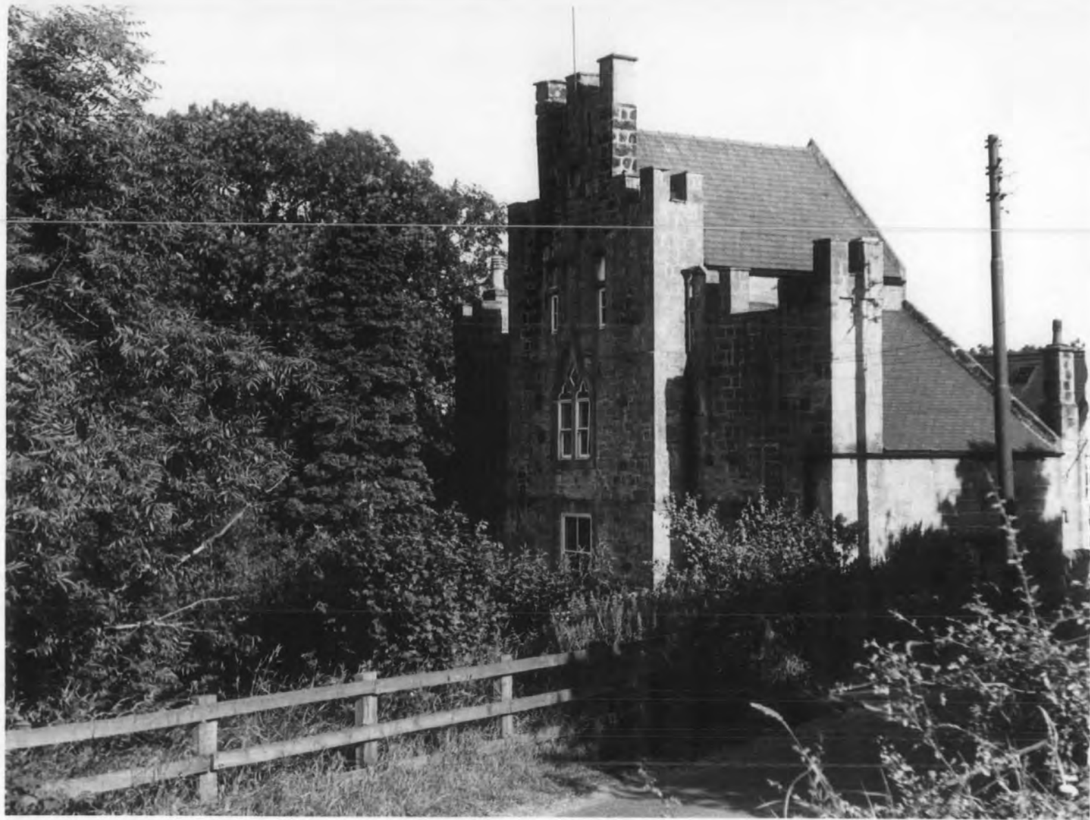
Plate Two. Hartburn village school, Northumberland built c.1750. Stables formed the lower storey with the school above.