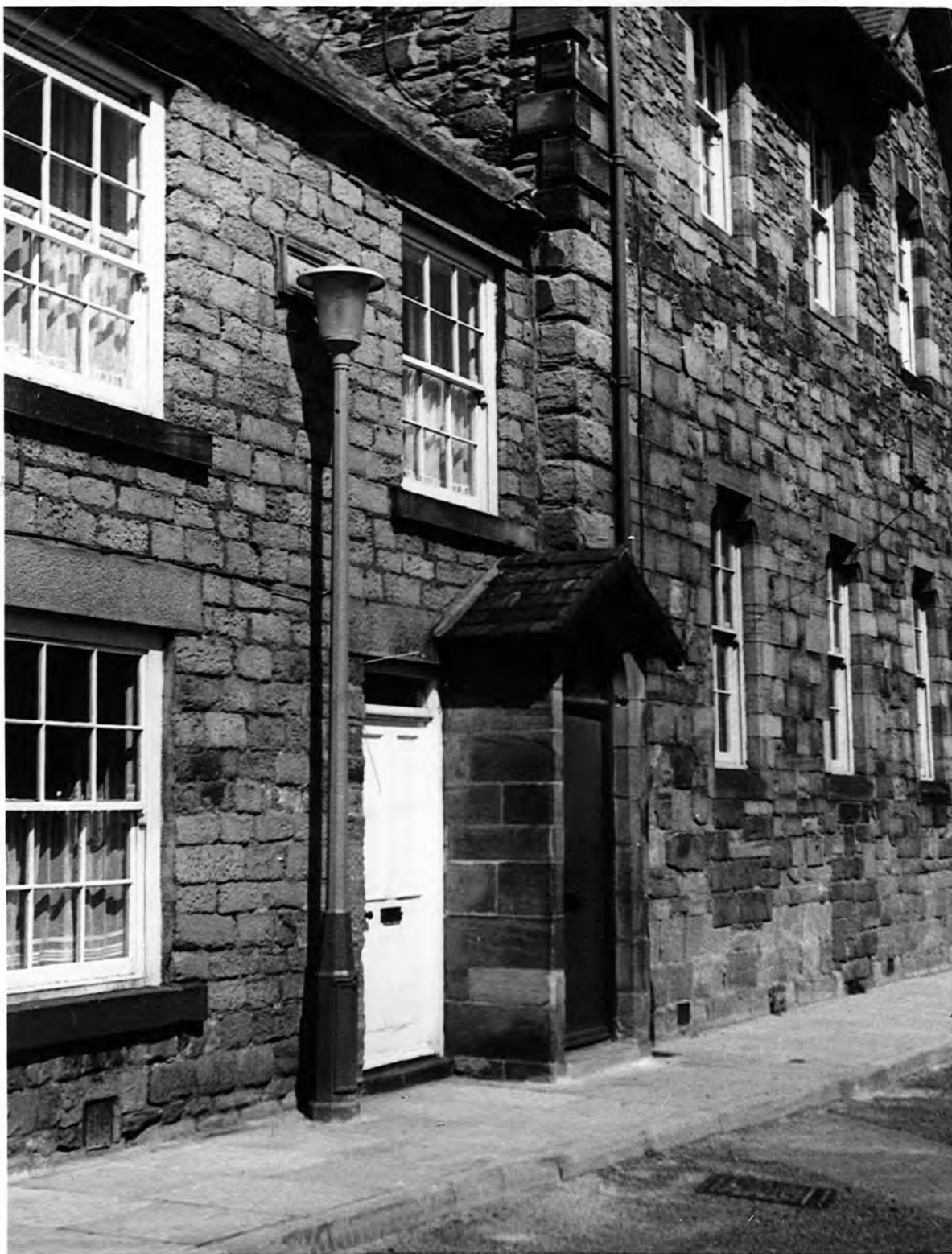
Plate One. Whickham charity school, Durham built 1742 and enlarged in 1825 and 1889.