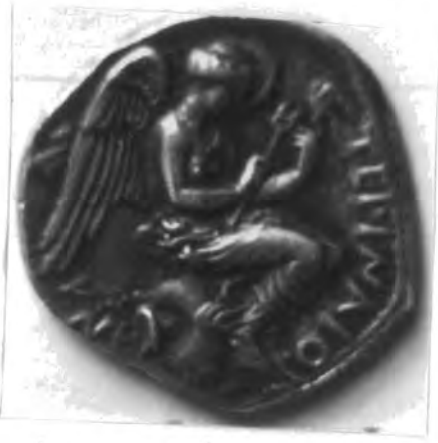
REGLING S/YY (x3).