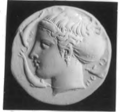
TUDEER REV. 29 (x2). TUDEER OBV. 16 (x2).