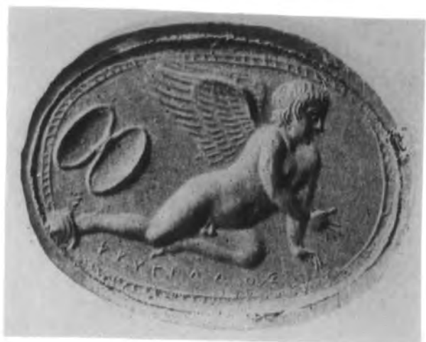
THE GEM (x2).