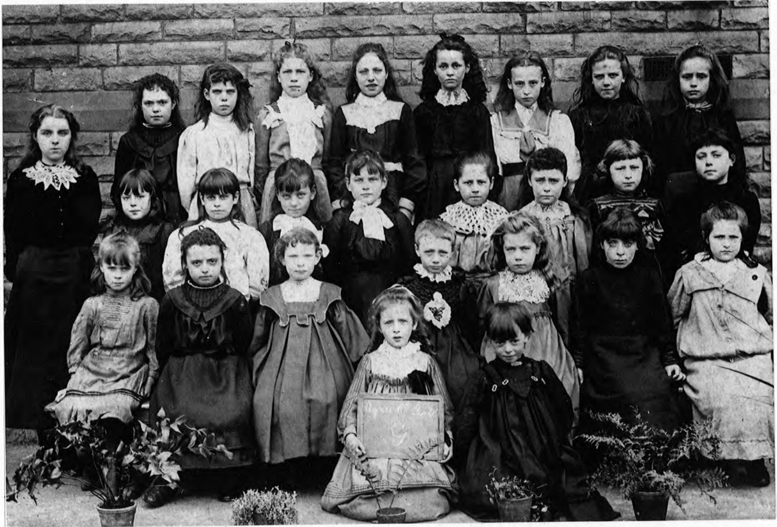
Working Class Children in Barnsley .