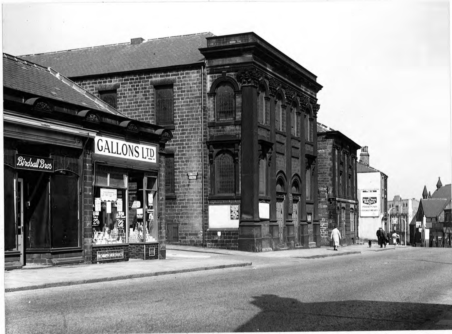
Britannia Street Chapel, 1850