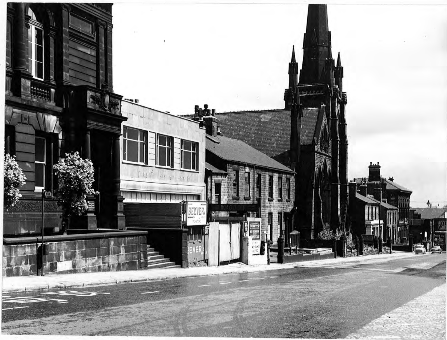
Regent Street Chapel.