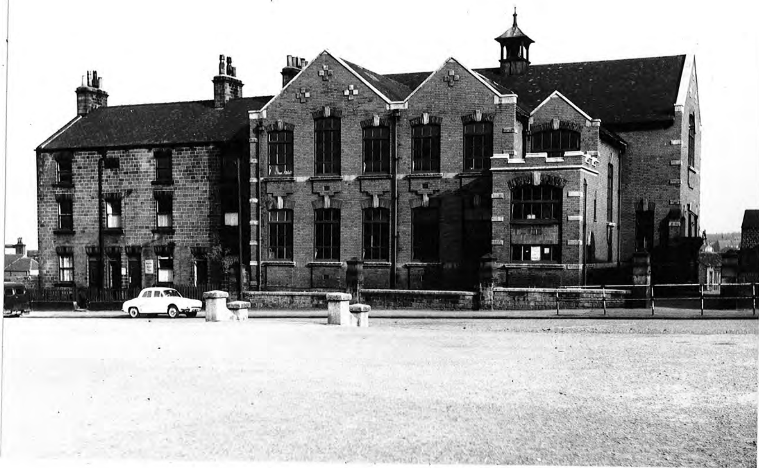
St. Mary's School.