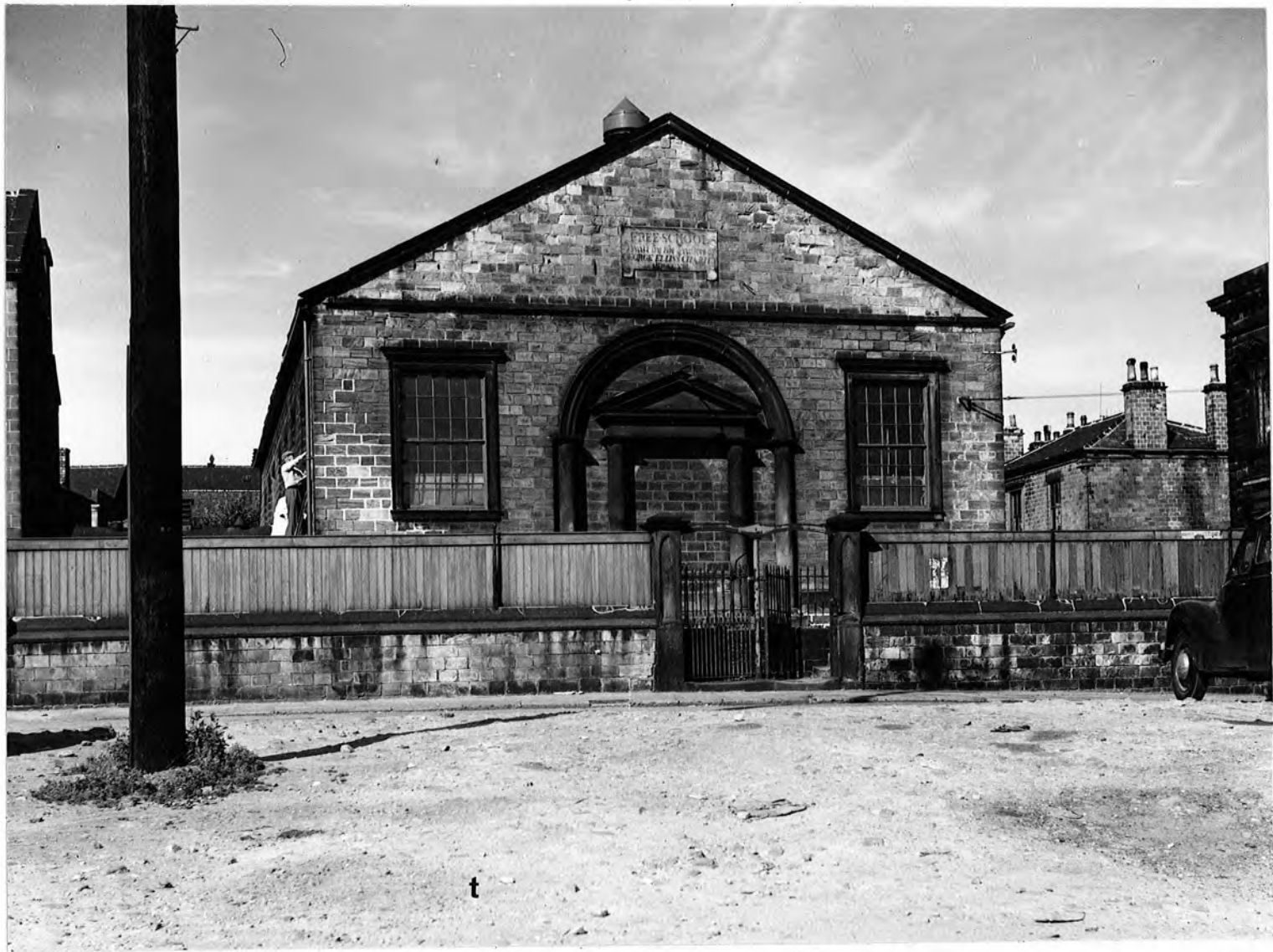
Ellis Charity School.