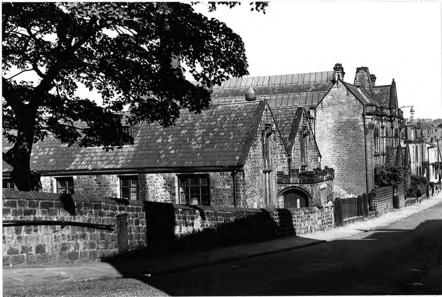
York Street Girls' School ,