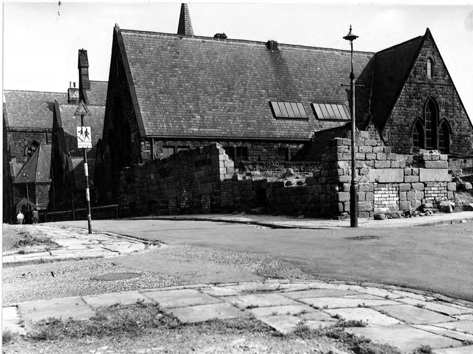
St. John's School