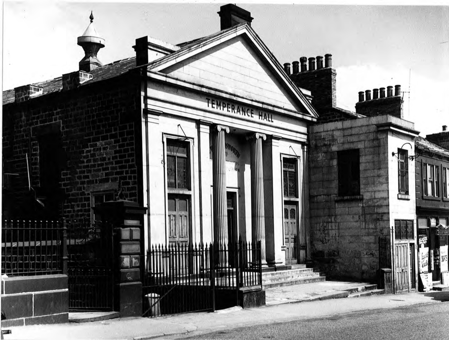
Temperance Hall. 1850