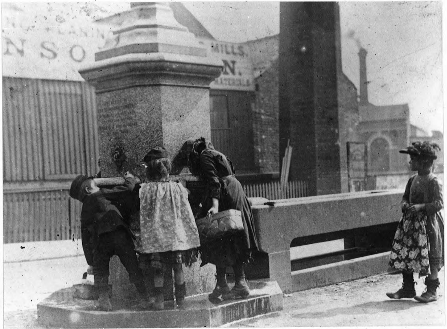
Working Class Children in Barnsley.