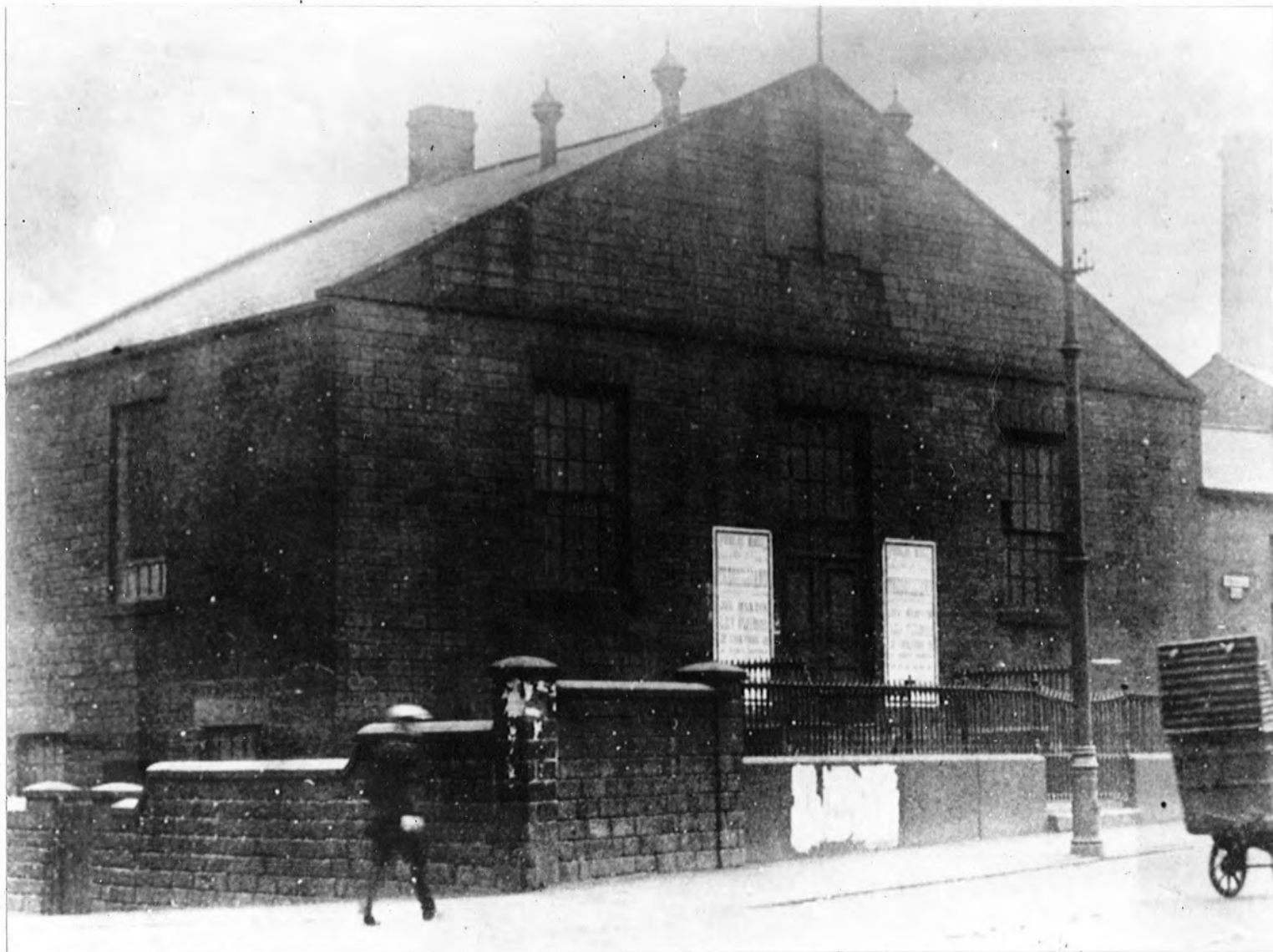
Wesleyan Day and Sunday School