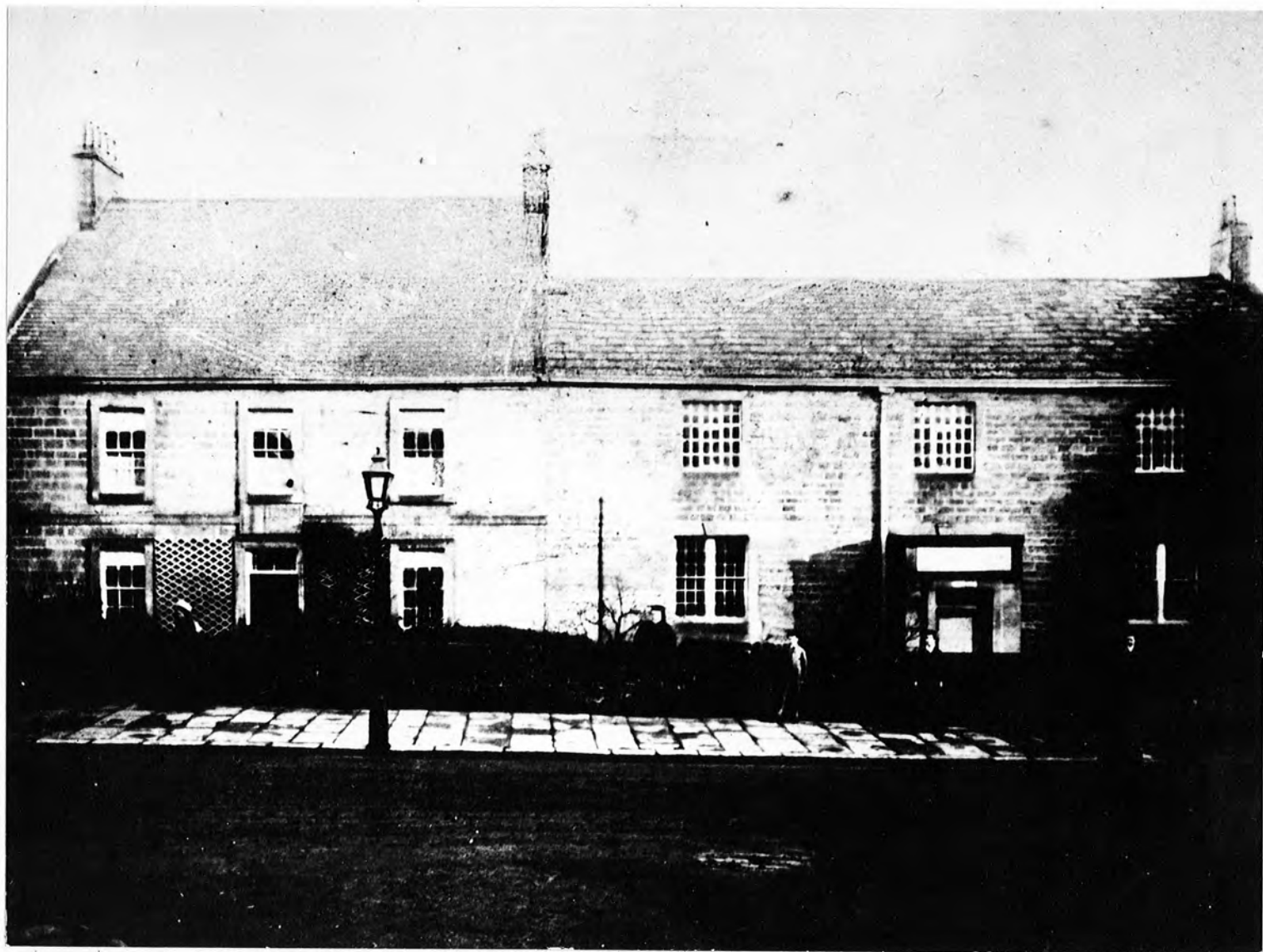
Endowed Grammar School, Barnsley.