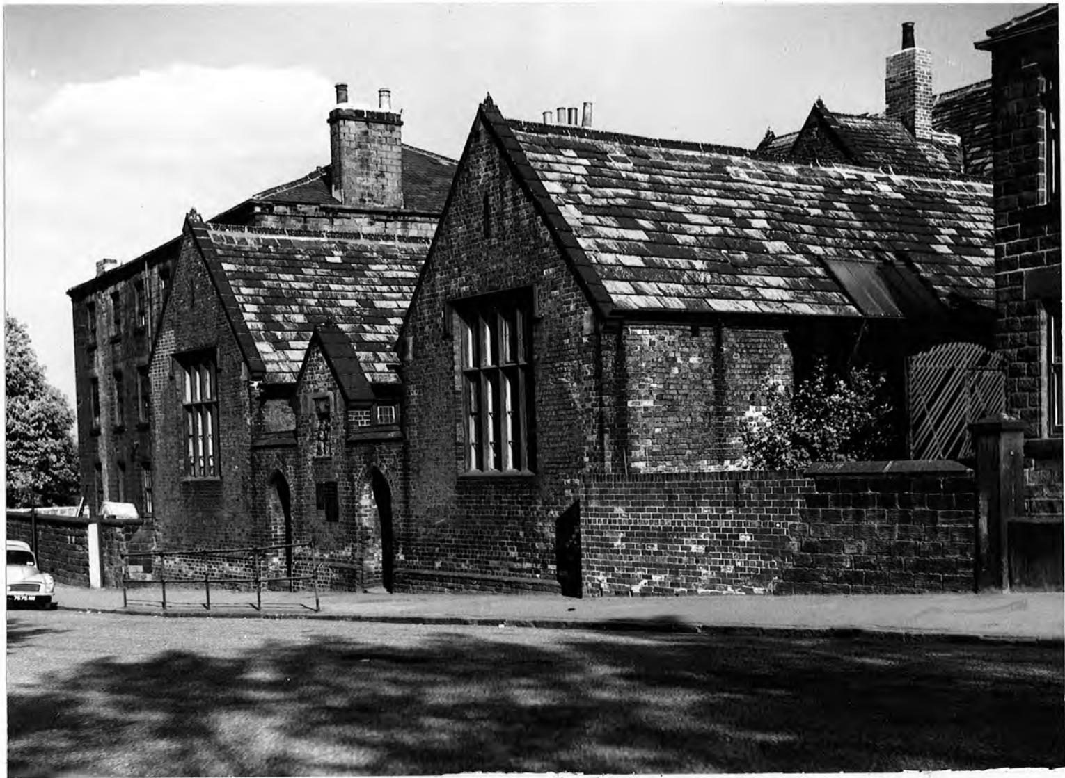
St. Mary's School .