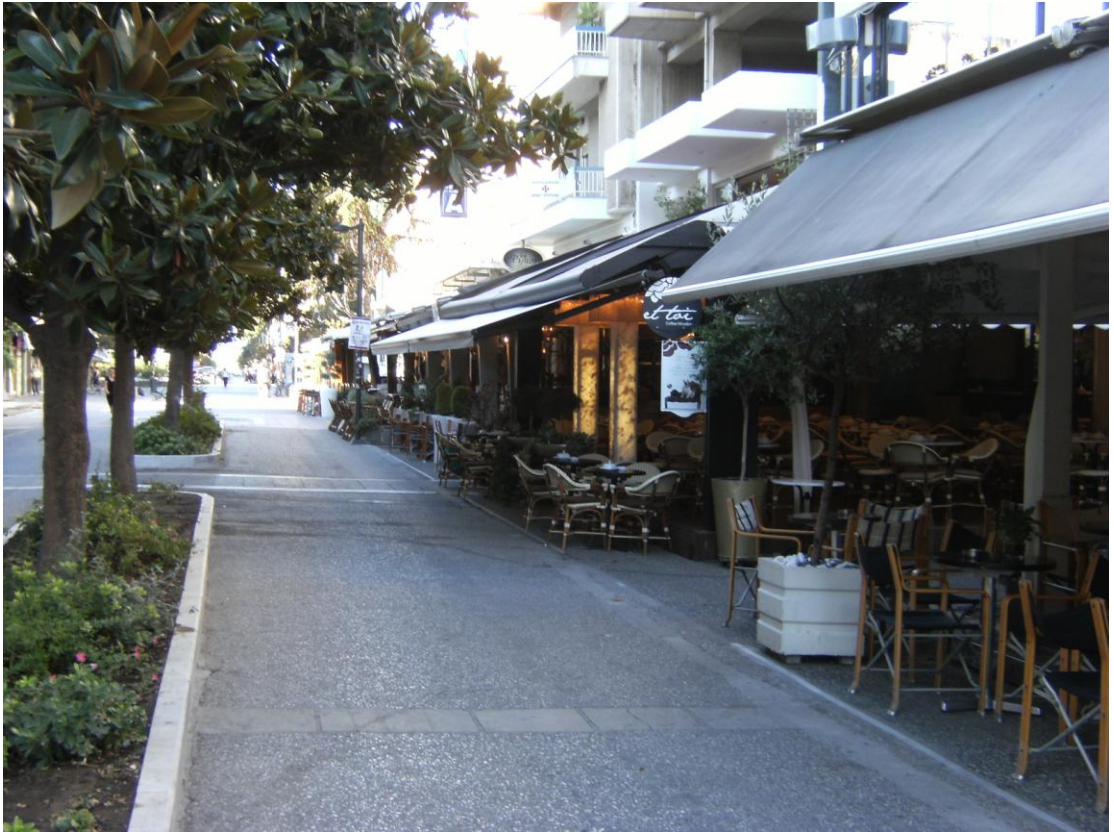
Picture.2. Setting up for another day's trade: early morning on Asklipiou