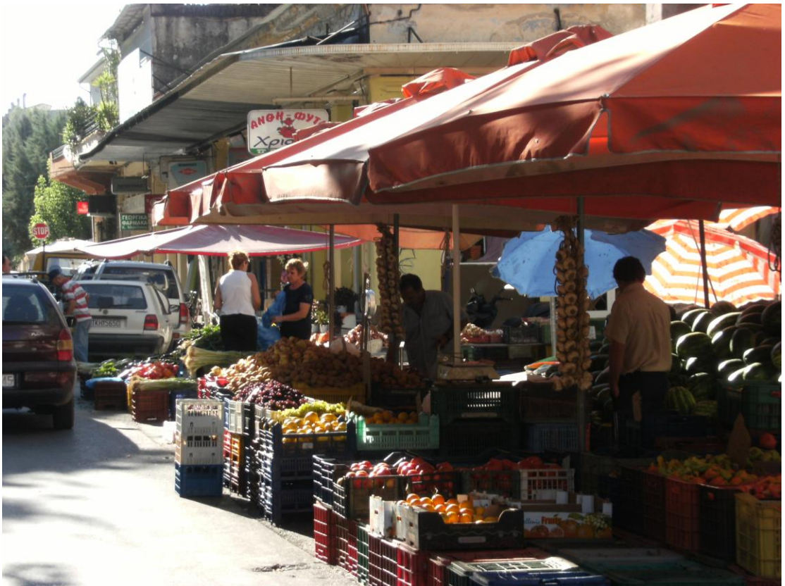
Picture.3. Monday market in central Trikala