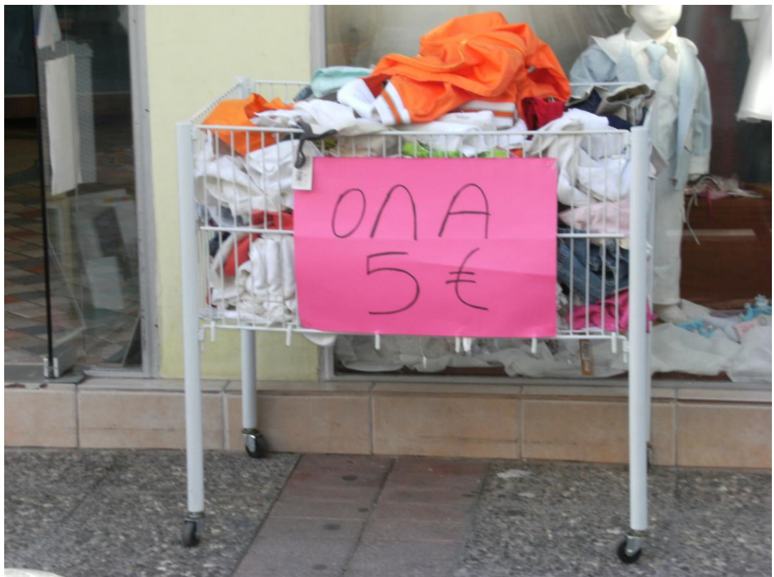
Pictures. 4 and 5. Examples of mid-summer sales on Asklipiou. The banner on the shop reads “For two more weeks even lower prices”. The sign on the bottom