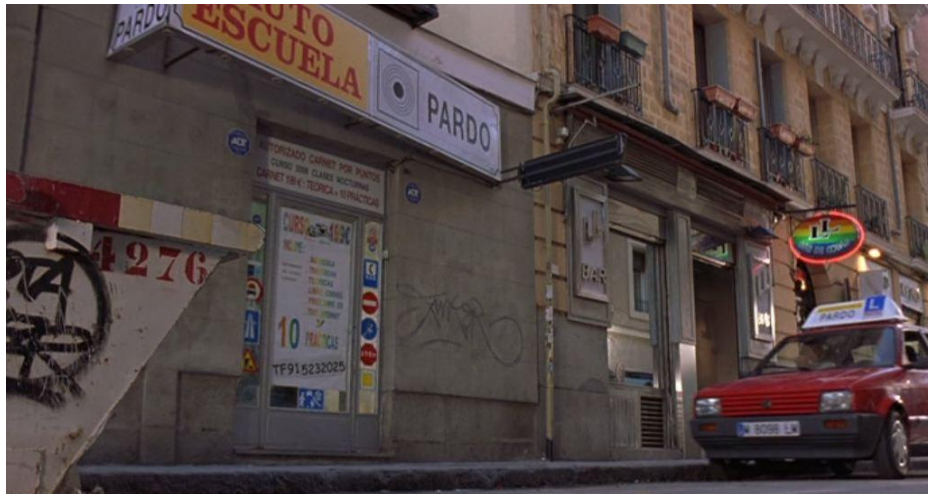
Figure 3 – Auto Escuela Pardo in Chuecatown

Leo – and his homophobic employer – work, not to mention the greengrocers’ shop owned by Leo and Rey’s straight best friend – the traditionally named Lola (Mariola Fuentes). We also see this in the police station, with its Spanish flags and photos of King Juan Carlos, and in the shabby, dated hospital where Leo and Rey are reprimanded by a homophobic nurse for kissing and then again for talking too loudly: ‘señores, casi prefiero que se besen’ (‘gentlemen, I’d almost prefer it if you kissed each other’). The nurse’s words can perhaps be seen to signify the homophobia of traditional institutions more widely.