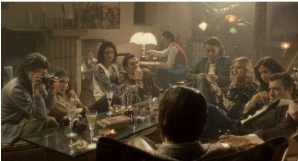
Figure 15 – Biedma, in the foreground, surrounded by his friends in El cónsul de Sodoma

The music score highlights the film's key themes of death, the passing of time and the fleeting nature of youth, all of them worries that populate Jaime's and his friends' conversations. Sara Montiel's La flor del mal ('The Flower of Evil'), is used over the images of Jaime lustfully looking at an athletic young builder in his flat, and then at a young rent-boy dancing with an older man in a clandestine nightclub. One of Jaime Gil de Biedma's poems is also heard in a voiceover (read by Jordi Mollà), with the sentences 'me recuerdas el pasado, y dices que envejezco' ('you remind me of the past, and you say that I am growing old'), following shortly after Montiel's verse 'y por mi eterna tristeza' ('and because of my eternal sadness') is heard. It is not homosexuality that is being analysed here, nor presented as the cause of the 'eterna tristeza', rather it is the simple human sadness at time running out – that he is growing old ('envejezco'). These themes, as he discusses with his group of friends, all writers, are not part of his (homo)identity, but are a shared feeling.