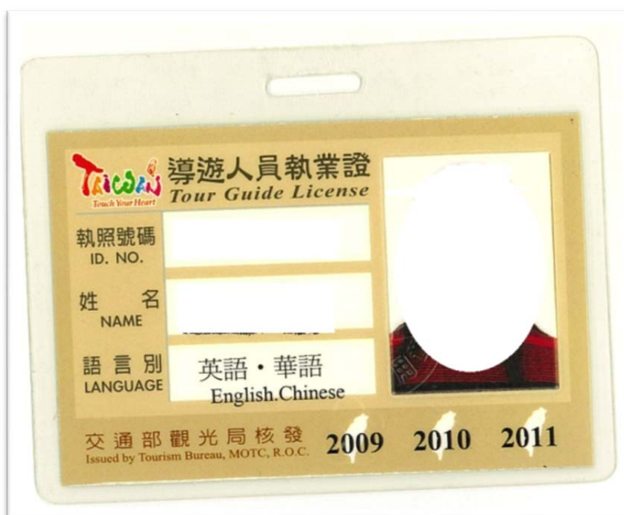
Figure 5.3 A Taiwanese tour guide license

L: Haha...Taiwan is not part of them at all...just that we wanted to take advantage! If they don't accept, we can say “hmm...I think there's some problem with your notion of national identity”...hahaha...this method is great...I'll have to use it next time!