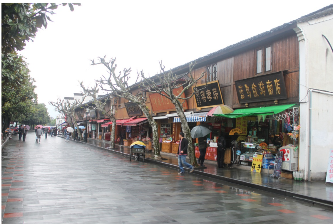
Figure 4.5 Main thoroughfare of Xikou Village