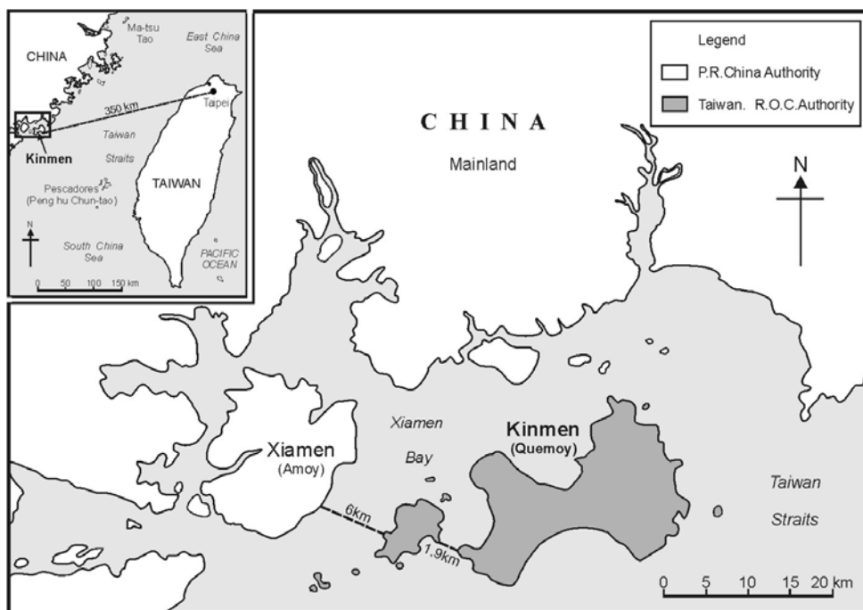
Figure 7.1 Location of Kinmen

Politically belonging to Taiwan, Kinmen is located 350km southwest of Taipei, Taiwan, but a mere 10km from the city of Xiamen in the People’s Republic of China (Figure 7.1).