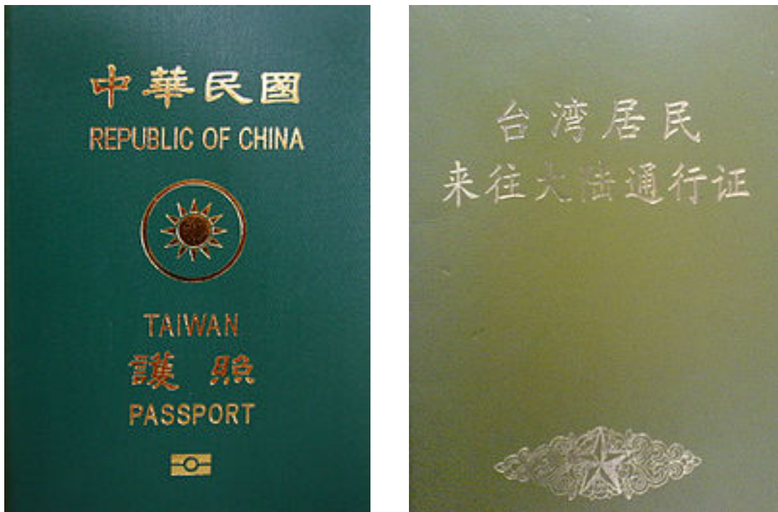
Figure 5.1 The Taiwan Passport (left) and the Taiwan Compatriot Permit

the Republic of China. The TCP is created by the Chinese Ministry of Public Security 18 and has been in existence since 1987 when the then Taiwan President, Chiang Ching-kuo lifted the travel ban across the Taiwan Strait. A typical Taiwanese crossing the border to mainland China would use the Taiwan passport at the Taiwanese checkpoint, and present the TCP to the Chinese authorities upon arrival in mainland China. Stamping on such a document thus allows both sides to temporarily avoid the sensitive issue of state sovereignty, on paper at least. In practice, this is not the case. A TCP holder is identified as someone who resides in Taiwan, but who is essentially a fellow countryman hence 'compatriot'. I am interested in how the possession of the TCP affectively interacts with the Taiwanese tourist at the checkpoint and how the checkpoint itself creates a liminal environment between home and away.