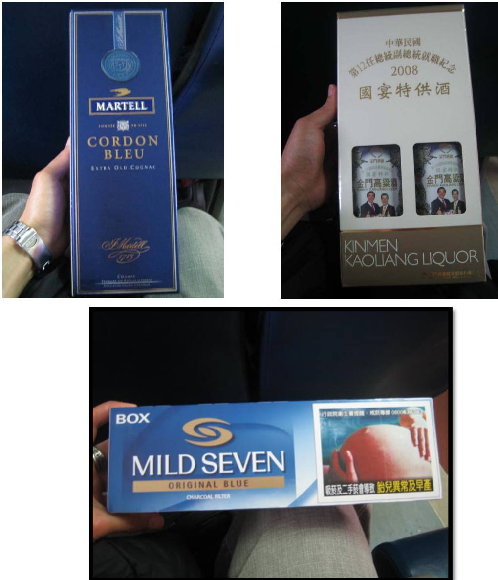
Figure 5.5 Examples of duty-free items

Taiwanese tourists would usually spend about fifteen minutes at the arrival hall of the ferry terminal waiting for their coaches and would often participate in such street economies with the locals. The tourists I spoke to revealed that the profit gained from the selling of duty-free items (Figure 5.5), which they have bought at the