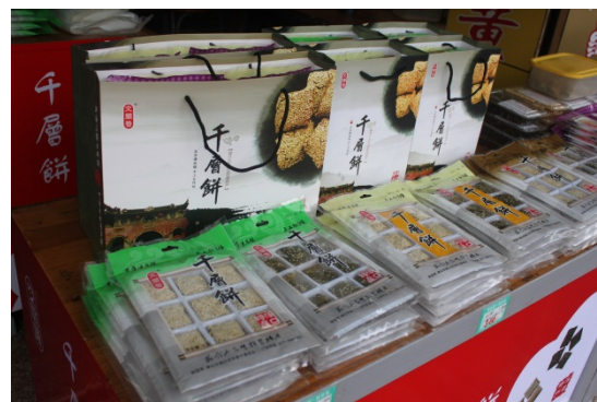
Figure 4.6 One of many shops selling ‘Chiang Clan Thousand-Layered Biscuit’ (Top); Thousand-Layered Biscuits in different flavours

Interestingly, my fieldtrip to Xikou coincided with a community twinning ceremony (社区结对仪式) between Fenghua and Da-shu (Kaohsiung, Taiwan). This ceremony was attended by Chinese officials from the Taiwan Affairs Office of Fenghua People’s