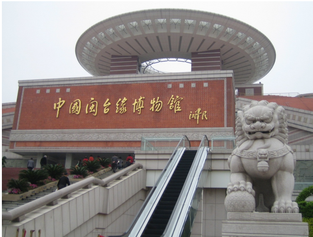
Figure 4.1 Façade of the China Museum for Fujian-Taiwan Kinship

Located in the city of Quanzhou in the south-eastern province of Fujian, the museum covers a considerable area of 23,332 m 2 and is 43m tall. The idea of having a museum to showcase the 'natural and historical bond' between China and Taiwan was first proposed in 2004 by Li Changchun (Director of the Central Spiritual Civilisation Steering Committee of the Politburo Standing Committee). The fact that it is given 'national level' status goes to show the high priorities accorded to it by the central government. Perhaps it was due to the pro-independence leadership by the Democratic Progression Party (DPP) in Taiwan 12 that this project was deemed necessary. The DPP was then attempting to disassociate Taiwan with its Chinese heritage while actively promoting a Taiwanese identity. As such, the construction of a museum that reminds Taiwanese visitors of their kinship ties with mainland China