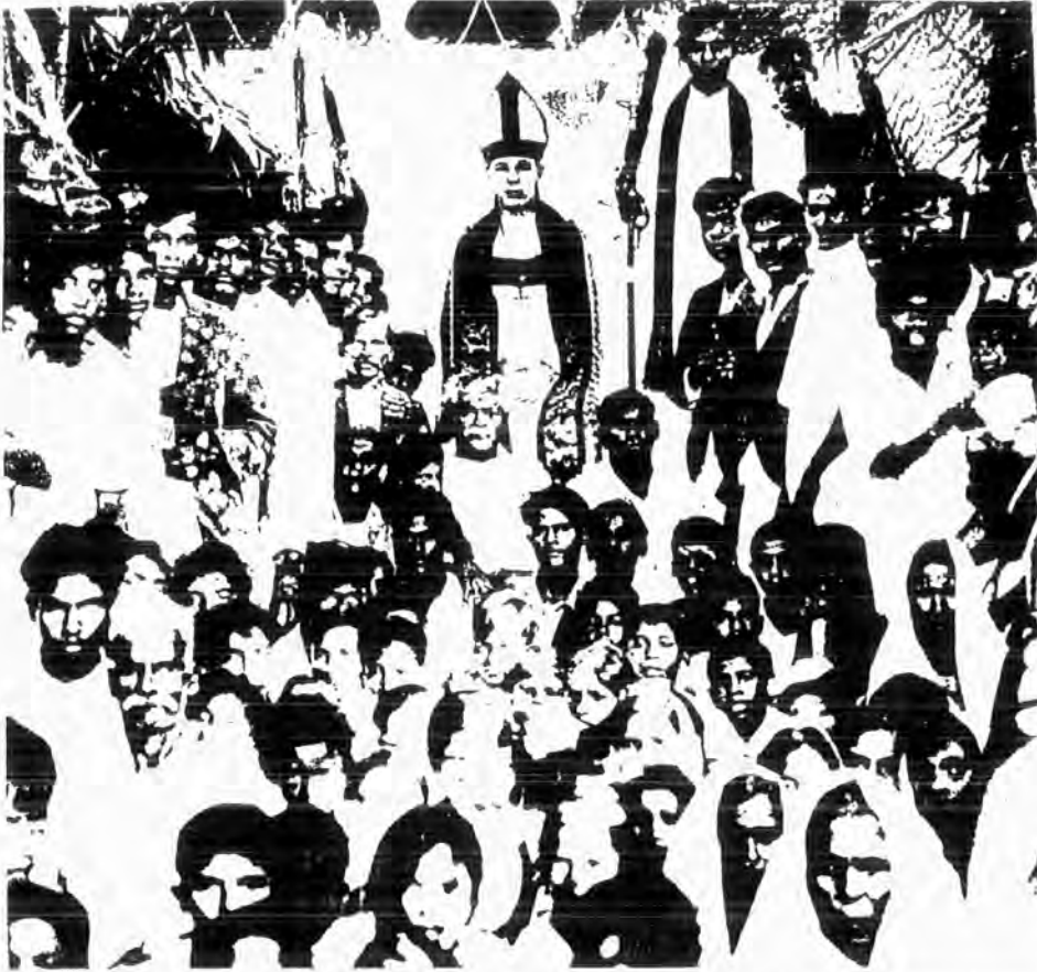
John Paul II in St. Peter's Square, Rome 1983

A TRADITIONAL COMMUNICATOR IN AN AGE OF REVOLUTION