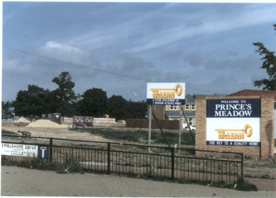
Prince's Meadow (July 1994)