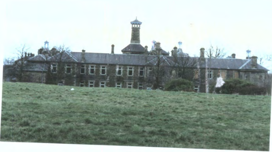
Hospital building and surrounding land (February 1994)