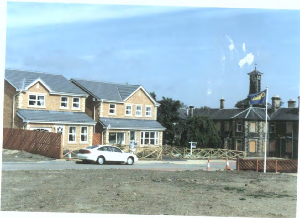
McLean's four bedroom detached homes (July 1994)