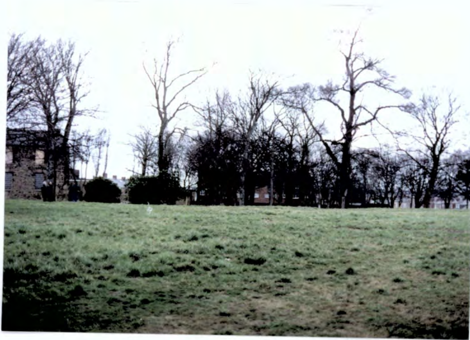
Facing north toward 'Dodd's Farm' (February 1994)