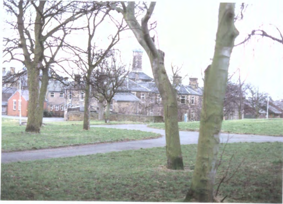
St Nicholas Hospital (February 1994)