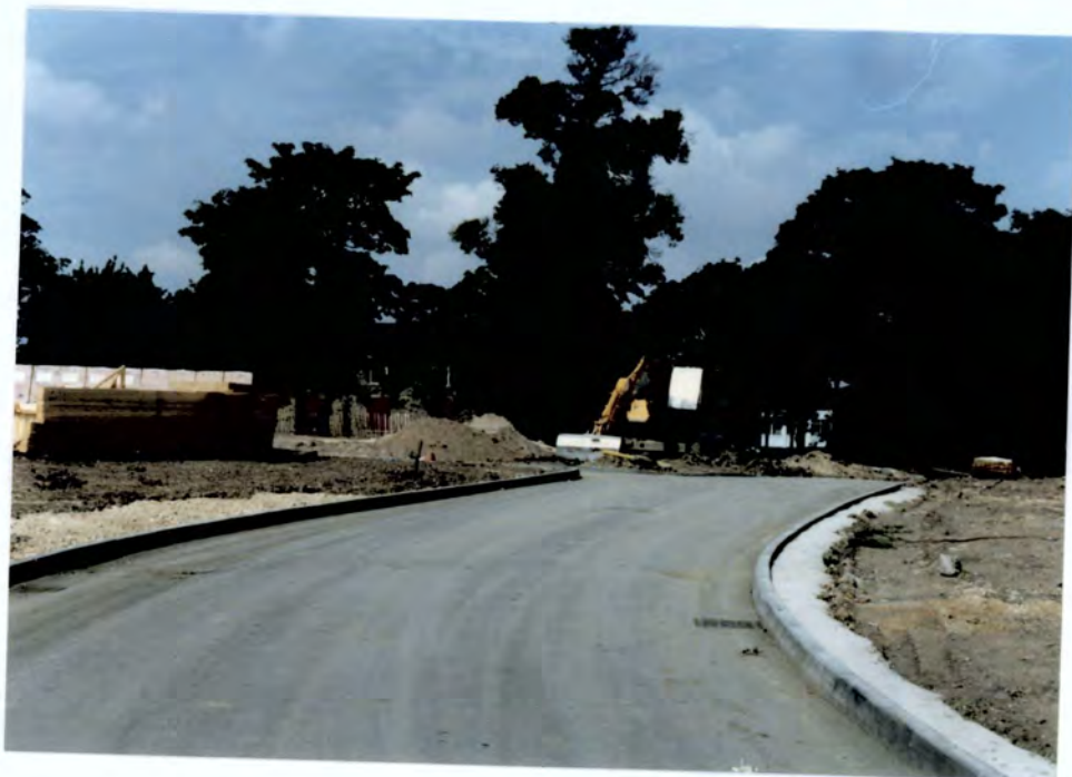
Access road parallel to Kenton Road (July 1994)