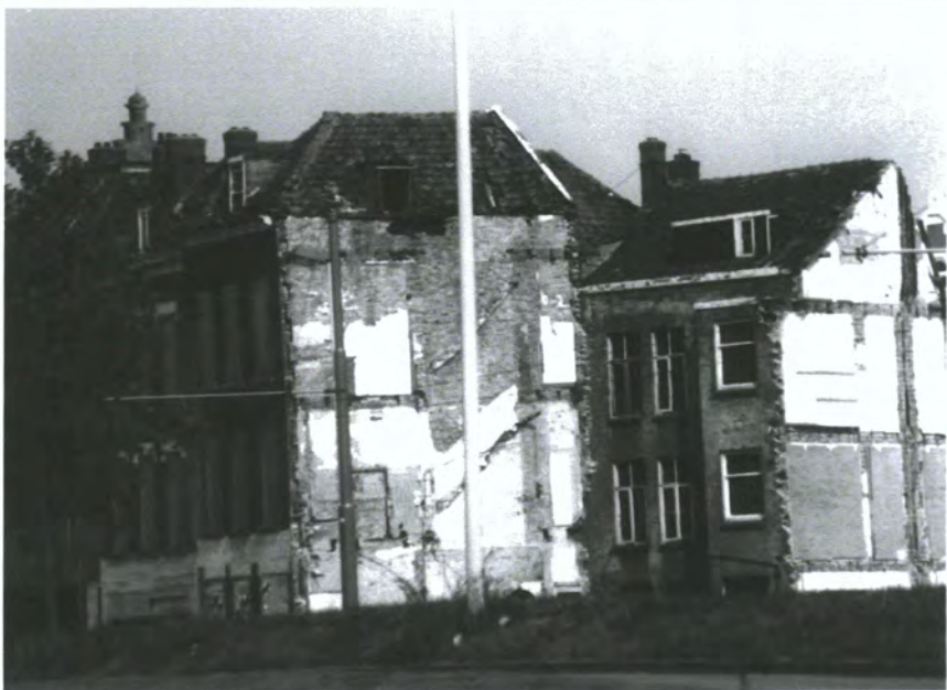
h. Housing dereliction in Feijenoord, 26/6/99