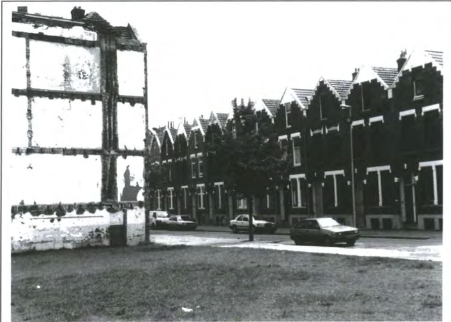
c. Boarded-up housing in Delfshaven, 26/6/99