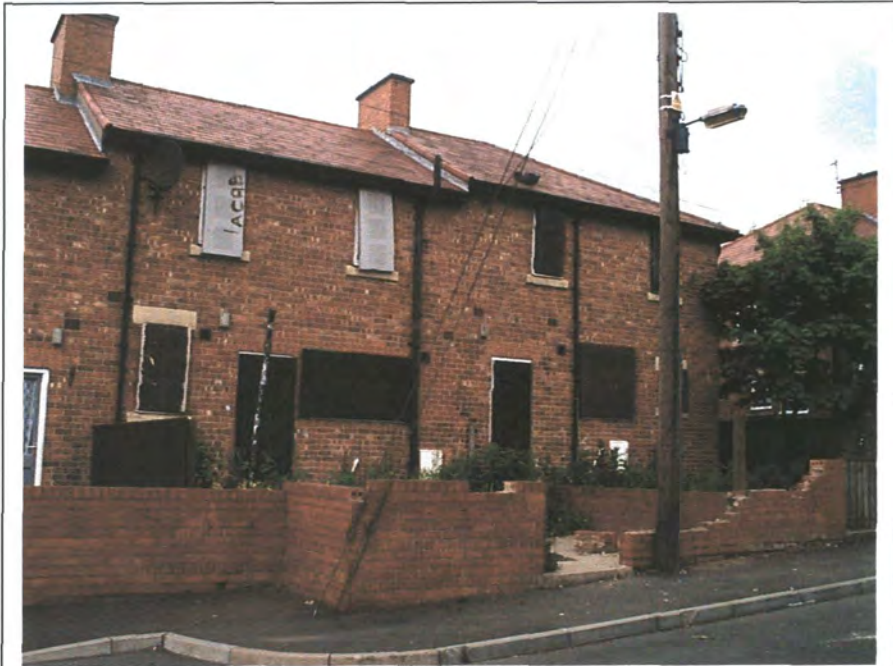
e. Isolated boarded-up house in Weetslade, 10/6/99