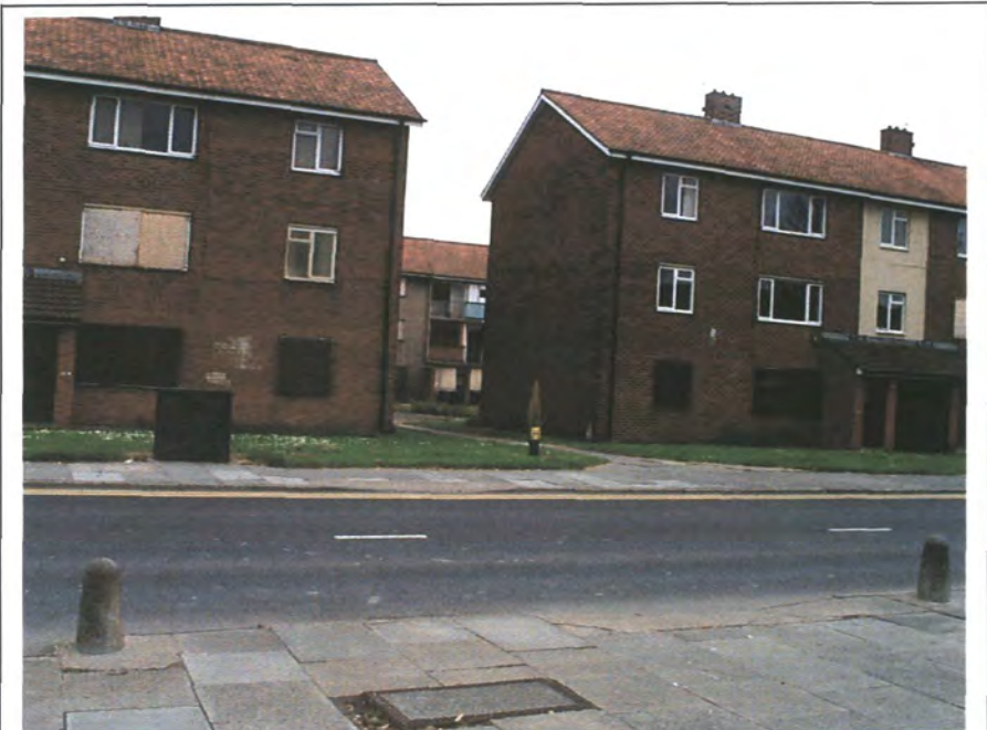
f. Urban malaise on the Longbenton estate, 10/6/99