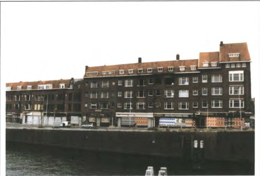
d. Housing dereliction along Coolhaven in Delfshaven, 26/6/99