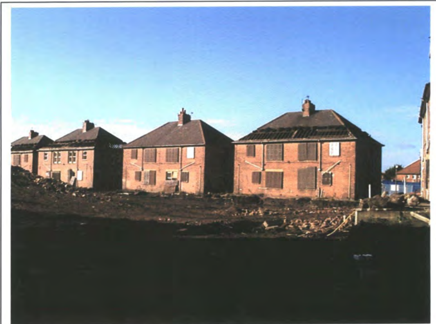
d. Boarded-up housing and dereliction in Rosehill, 18/10/98