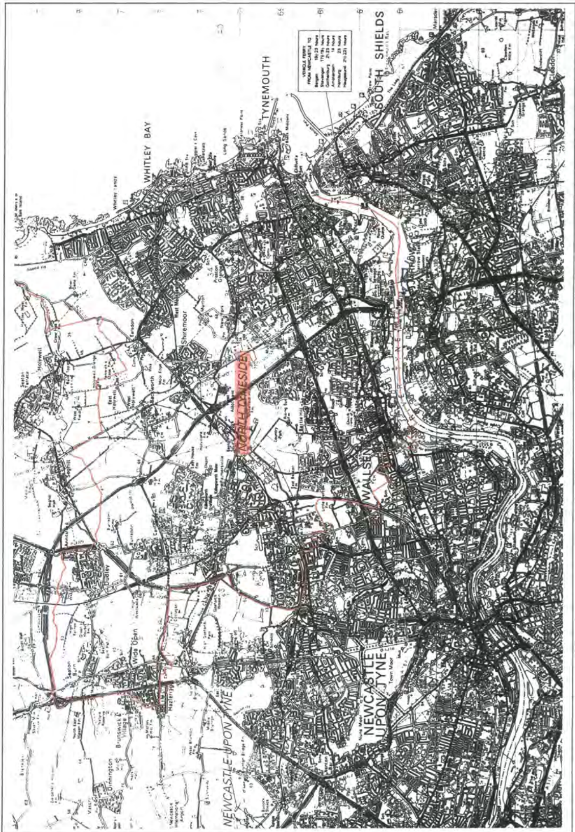
Appendix 10 Map of North Tyneside (not to scale)