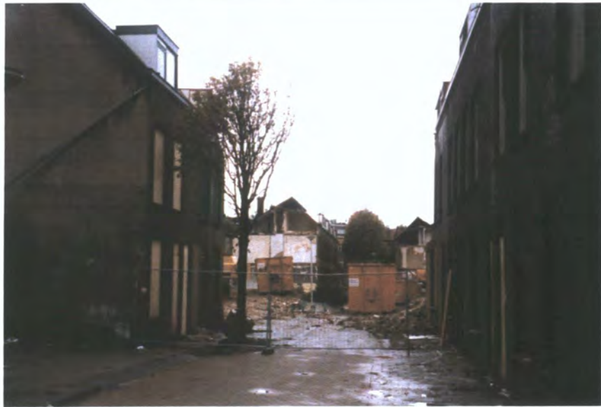
g. Urban decay in Bloemhof, 14/10/98