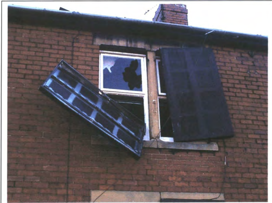
a. Housing dereliction and vandalism in Rosehill, 18/10/98