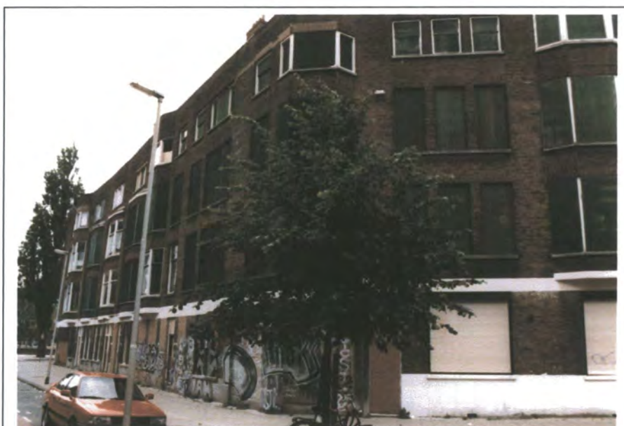
e. Boarded-up housing and graffiti in Delfshaven, 26/6/99