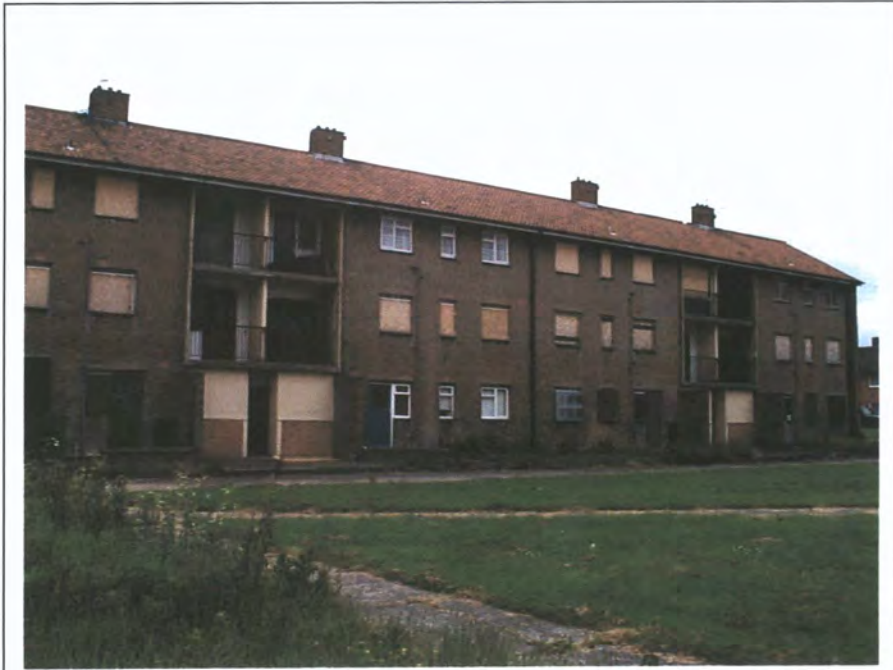
g. Urban dereliction on southern edge of Longbenton, 10/6/99