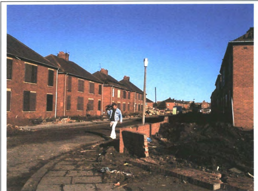
b. Boarded-up housing in Rosehill, 18/10/98