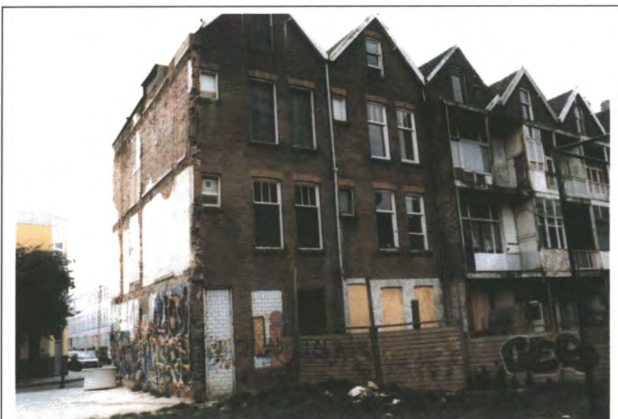
f. Dereliction in Delfshaven, 26/6/99