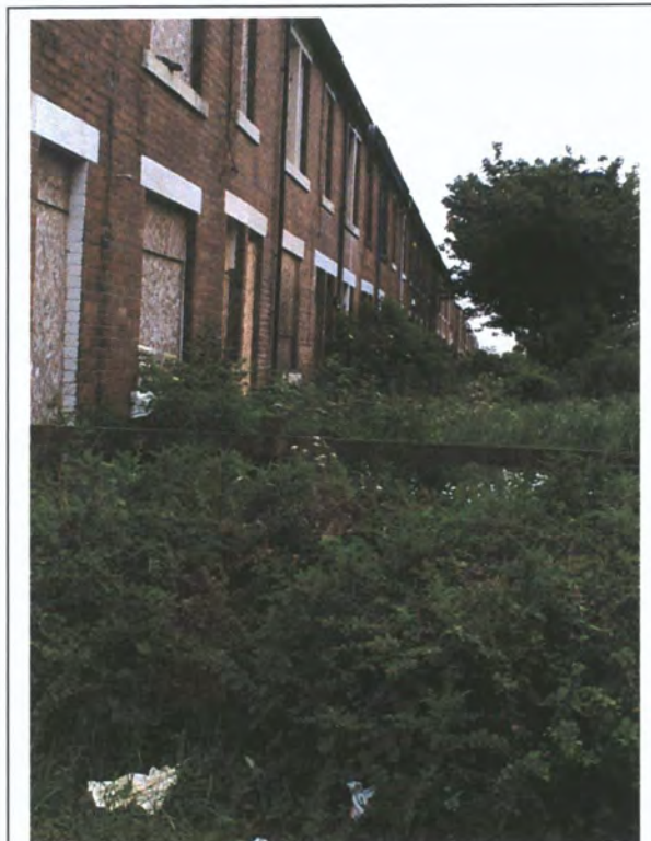
h. Boarded-up housing and environmental neglect in Rosehill, 10/6/99