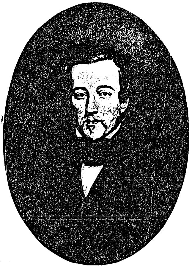
THE VICOMTE DE FALLOUX IN 1837