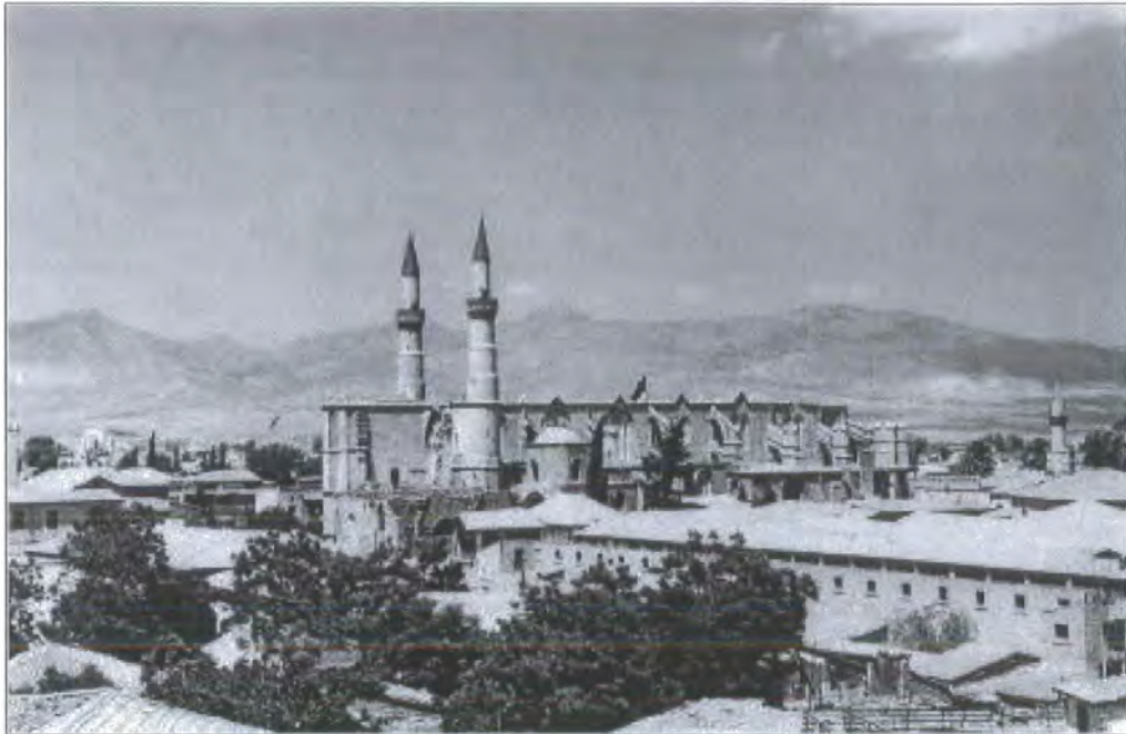
The view north. This view of a mosque in north Nicosia was taken from a building adjacent to the 'Green Line.' The mosque symbolises the history of Greek and Turkish ethnicity on the island. It was once a Christian cathedral, but was converted by the Ottoman Turks after their invasion in 1570. The mountains in the background are the Kyrenia range. On the central-left edge of the picture, a giant Turkish flag that has been cut in to the rock of the mountain and is clearly visible in the south, can be faintly seen as a pale area. It's existence is a symbol of Turkish control over the north and is greatly resented in the south.

justified its invasion on the basis of the Treaty of Guarantee, which had formed part of Cyprus' post-independence constitution. This enabled Greece, Turkey or Britain to intervene if the constitution was threatened as it had been by the Greece-inspired coup. Legal justifications apart, the invasion was ruthless, indiscriminate and led to the deaths of many thousands of innocent Cypriots. Although the major powers did not intervene to prevent the Turkish occupation in 1974, they have at least refused the Turkish held north the legal status it needs to break away from the Republic. In doing so, they have ensured that there is still hope of re-unification, however slim that prospect is becoming with the progress of time.