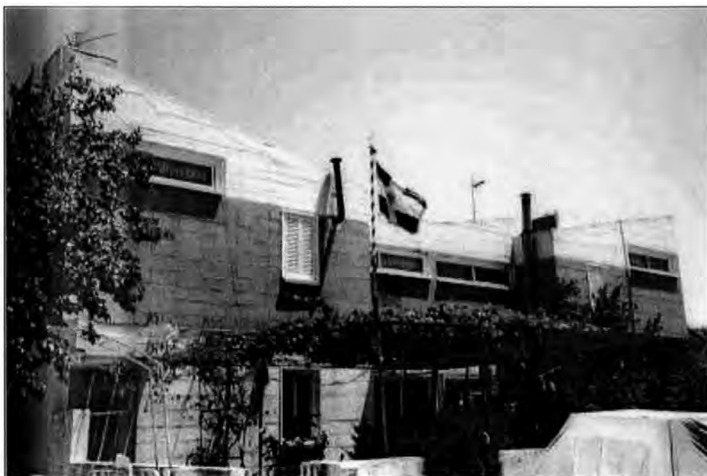
A flag emphasising Cyprus' Hellenistic identity flies outside this estate home. Identity is partly constructed along lines of nationalism. The partition of Cyprus is a part of the wider struggle between Greek and Turk.

The key to this dilemma lies in the language that young refugees use to describe their aspirations for return. The same commitment to return is vocalised by second-generation refugees as by their older relatives and in many cases it is spoken of even more vigorously. But the language used by younger refugees, appears in many cases to be bound into a framework of nationalism and antagonism toward their Turkish neighbours that is not often vocalised by their parents. The implication is that attitudes toward return are mediated and shaped through the context of the formal education that young refugees receive and through the constant ideological portrayal of the struggle from political and media sources. These attitudes are bound into a larger Cypriot identity that portrays Cyprus as the victim, whilst emphasising Turkish aggression and barbarity.