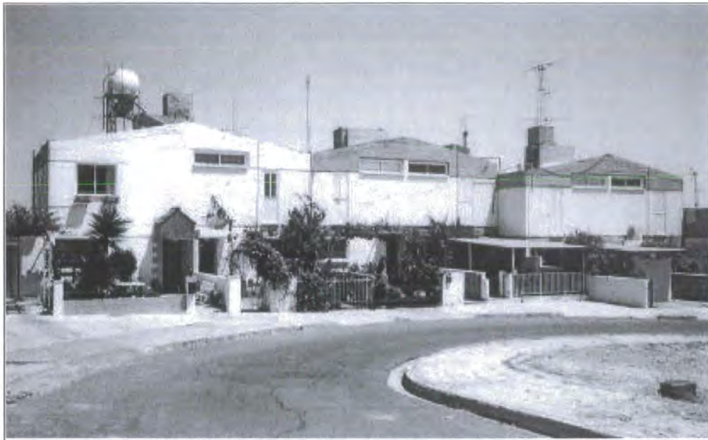
The house on the left of this picture, has recently undergone investment after the owner received title for his property. New windows, an extension (on the far left) and a new roof-mounted heating system have all been added. Other houses retain the appearance they had when they were first constructed.

has provided refugees with a potent strategy for keeping alive the issue of their displacement and their demands to have their original homes restored to them.