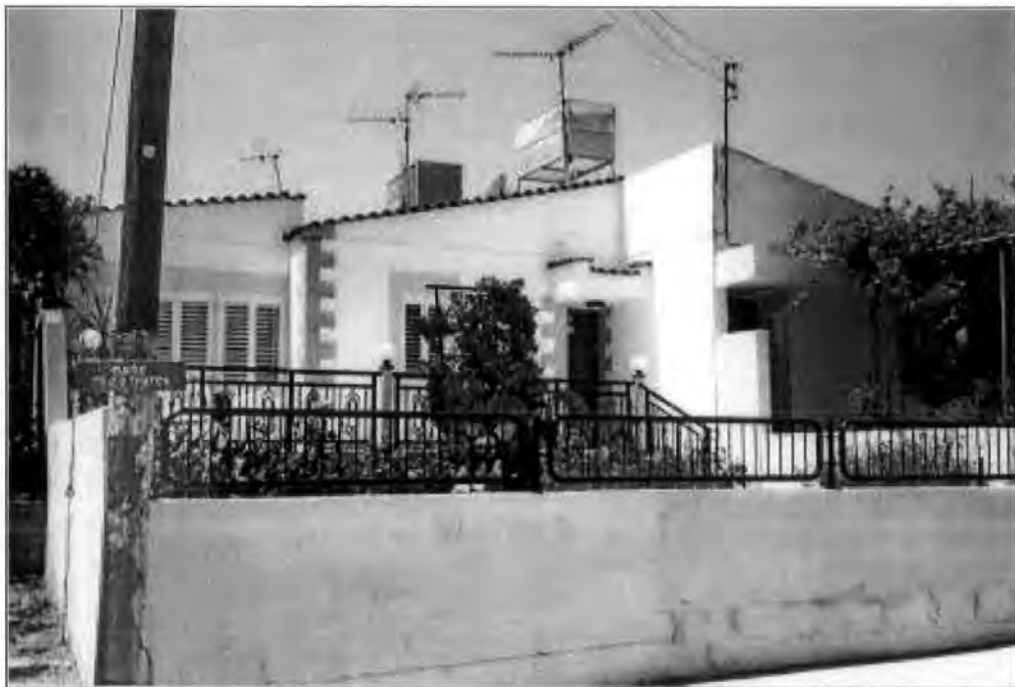
Ownership of title deeds enables refugees to use their property as capital for loans that can be used to alter the appearance of the house. The identity of the house on the left has been dramatically changed to suit Cypriot aesthetic notions of design. It contrasts with the house on the right, which retains the monotonous and industrial appearance of social housing.

- particularly for their desire to return home - but they were probably never ignorant of its short-term impact on their lives as they would have to live them on the estates. The contention here, is that refugees have always coveted ownership of their estate houses, not it might be added, because they believed the houses would be any kind of compensation for those they left behind in the north - they are an inadequate replacement for the financial and emotional investment made in their long cherished family properties - but because ownership of estate properties would alleviate some of the burdens and barriers to normality that are placed on them by government policy: the stigma of dependency, the lack of flexibility and control over the transmission of the property and the inability to use the properties as capital for loans.