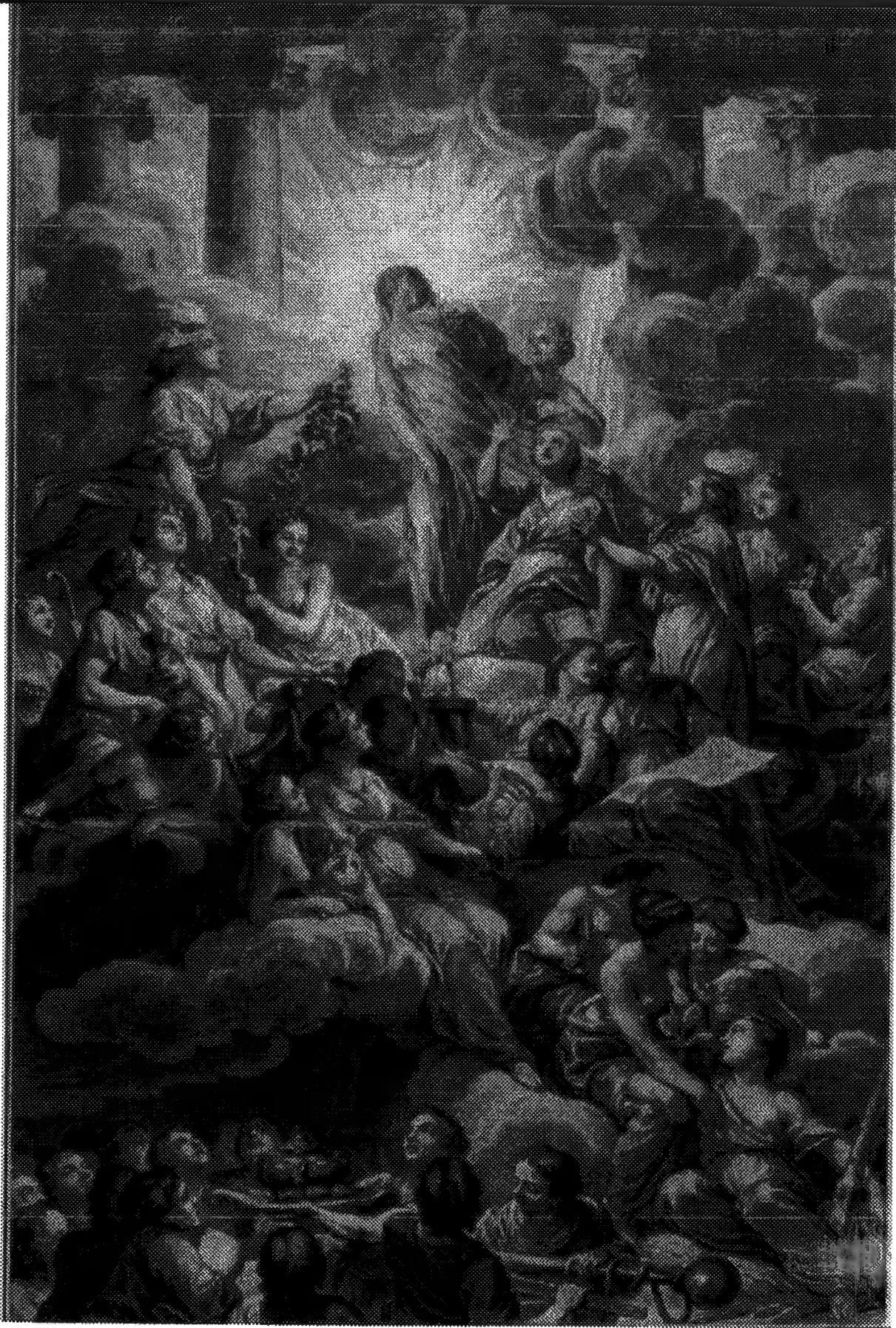
Frontispiece: Engraving by Benoît-Louis Prévost, Frontispiece to the 1772 edition of Diderot and D'Alembert's Encyclopédie (Fine Arts Museums of San Francisco). The engraving shows Truth, wrapped in a veil, encircled by Reason, Philosophy, Theology, and other personifications of sciences, arts and crafts.