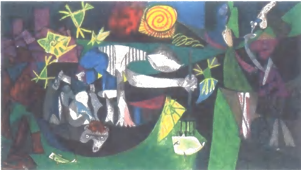
Fig. 1. Pablo Picasso, Night Fishing at Antibes .

triggers Wyatt's reverie is Picasso's oil painting from August 1939, Night Fishing at Antibes (fig. 1).