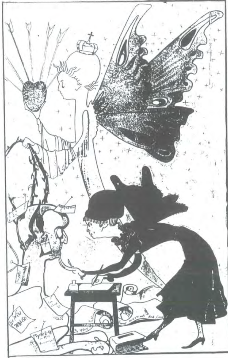
Fig. 1. Caricature of May Sinclair by Jean de Bosschère.