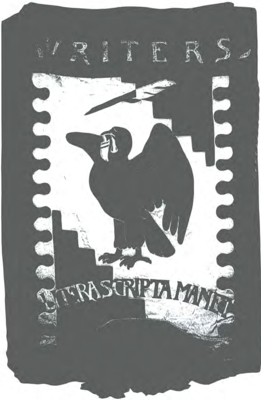
Fig. 3. Women Writers' Suffrage League banner. 18

white banneret bearing such familiar names as George Eliot, Fanny Burney, and Elizabeth Barrett Browning . . . 17