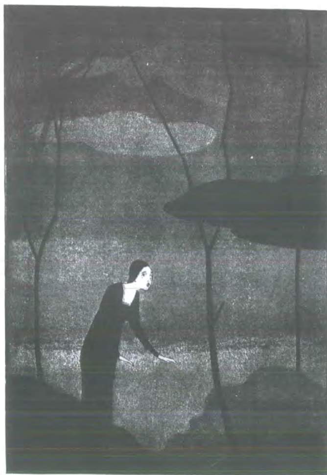
Fig. 9. 'She saw the world in a loathsome transparency'.

This polarity between the vision and the anti-vision is familiar from the writings of Christian mysticism. All that had previously promised life, hope and immanence is now marred by their polar opposites: dissolution, 'the corruption of life', and 'the passion of the evil which was Life'. All that was once familiar and heimlich to Agatha has become unfamiliar and unheimlich . The tale operates on these oscillations: everything that was once familiar to her now becomes 'horror and fear unspeakable' (US 119) as illustrated in figure 9 below: