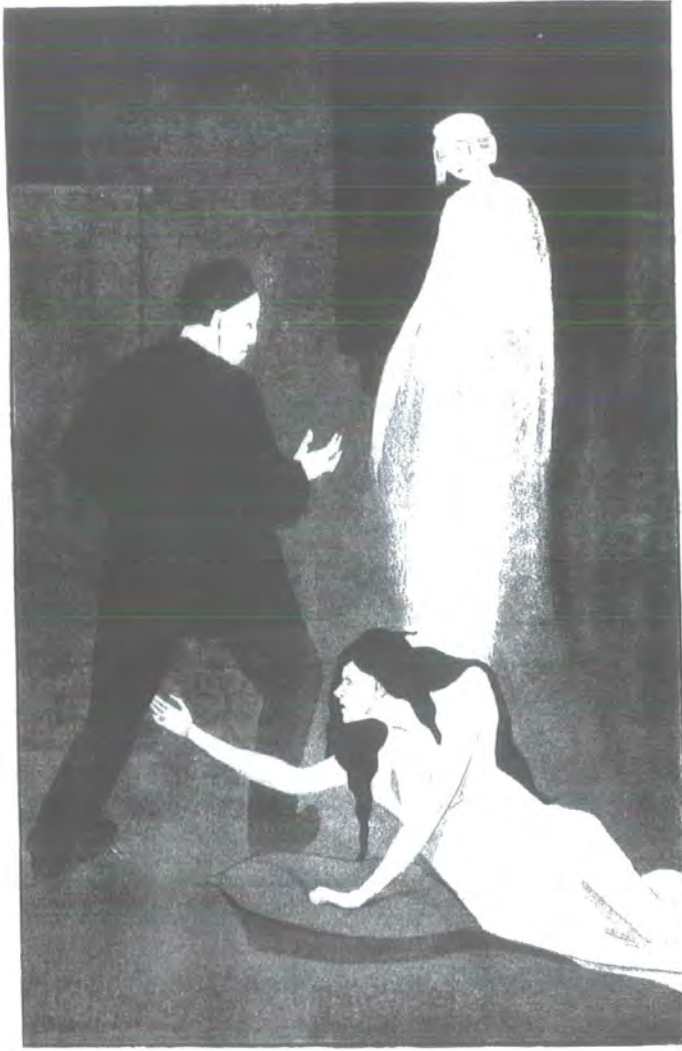
Fig. 5. 'Pauline's naked body . . . drew itself after him, like a worm, like a beast, along the floor'.

In 'The Token' there is another uncanny return of the wife as a phantasm. Cicely Dunbar's marriage is repressive and she is constantly denied acknowledgement of love from her husband. After her death she returns and is set upon extracting a signal or token from Donald of his feelings for her. However, Cicely is a voiceless, or aphasic, ghost. Helen, Donald's sister, inherits her 'uncanny gift', or—as Donald refers to it—'hysterical fancy', from her mother and is able to detect Cicely's phantasm. Through unspoken communication or telepathy, Helen acts as an intermediary to interpret and impart Cicely's message: 'I knew now what it wanted. It was trying to make itself seen