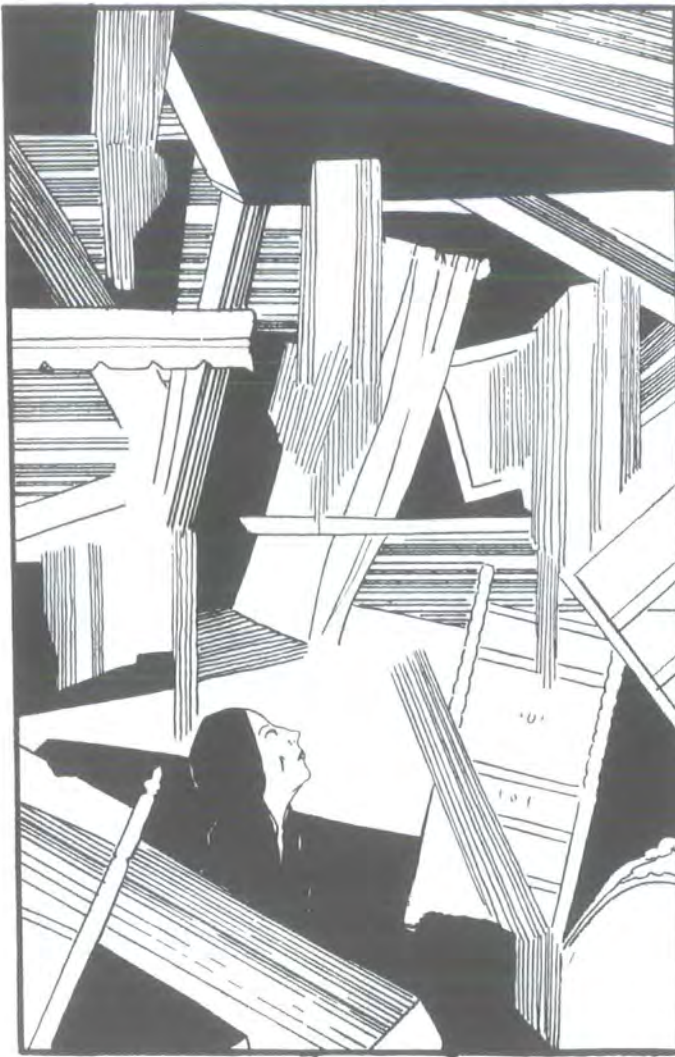
Fig. 8. 'Then, suddenly, the room began to come apart . . .'.

Now Harriott embarks on a series of spiraling deaths and rebirths. Harriott is shown to have a plurality of selves or states of being, and desire is no longer attached to a single domain or landscape but gains new meanings and associations. Death turns out to be 'bliss' for Harriott: ' "This—is—dying. I thought it would be horrible. And it's bliss. . . . Bliss" ' (US 23). Similarly, as I discussed in Chapter 5, Harriett Fren's reunion with her mother at the point of death gives rise to a sense of ecstasy. Her return to the archaic maternal gives way to a final sense of the eternal timelessness that is glimpsed at throughout the narrative. 133