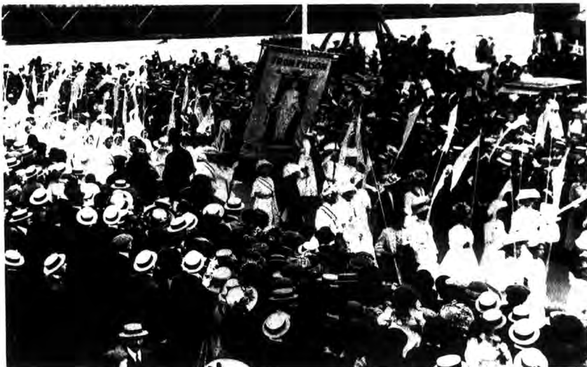
Fig. 4. 'From Prison to Citizenship' March. 19

Suzanne Raitt's use of terminology such as 'embarrassment' and 'ambivalent' to describe Sinclair's membership of the suffrage movement discredits both Sinclair and the WWSL. 20 Although Sinclair subsequently had problems with organised forms of suffragism, as described in The Tree of Heaven (1917), it stemmed from her interest in considering the individual rather than in viewing society as a mass, possessing a herd-like instinct. However, at this point, Sinclair's involvement with the WWSL gave her a close-up focus on the situation of the Woman Question as it was around 1908 to 1912. It may have encouraged her to consider perspectives that were novel to her; to build