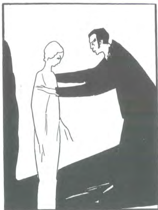
Fig. 7. 'He stepped forward, opening his arms'.

also lacks discourse: she is a wordless woman both before and after her death. Cicely's absence of language anticipates Kristeva's semiotic realm, which contrast with the patriarchal or symbolic realm of language. When her ghost returns to seek the truth, Donald confesses his affection for her and breaks the phallogentric symbol that marks their divisive world. As illustrated below in figure 7, at the moment of communion, the two converge in a symbolical union: 'He stepped forward, opening his arms, and I saw the phantasm slide between them. For a second it stood there, folded to his breast; then suddenly, before our eyes, it collapsed in a shining heap, a flicker of light on the floor, at his feet' (US 56).