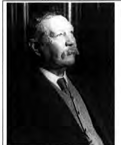
Fig. 6: Sir Arthur Conan Doyle (Clute and Nicholls, 1995)

It is not yet clear whether this is a deliberate play on the genre or whether this is a story in which the fantastic is possible. There are elements reminiscent of Sherlock Holmes stories (e.g. The Hound of the Baskervilles ) by Sir Arthur Conan Doyle. Fantastic or supernatural elements are not uncommon in those stories, and give an extra dimension to rather rational and predictable plots. Those familiar with Conan Doyle's technique can be absolutely sure that the master detective will find a rational explanation for anything uncanny. This is not the case in Отель . Firstly, the detective-story style of the opening is something unprecedented in the authors' career; and then the way an element of the fantastic is introduced to make it sound ridiculous (just another UFO story) will have had a startling effect on a readership already used to regarding space travel and extraterrestrial life as a proper subject for science fiction.