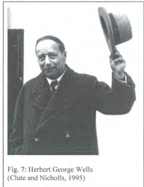
Fig. 7: Herbert George Wells

The first part is a clear reference to The War of the Worlds by H. G. Wells. In that novel Earth is invaded by Martians who land their spaceships in the South of England and conquer the whole world by merciless use of heat-rays, destroying anything that gets in their way. The Russian title Второе нашествие марсиан (The Second Martian Invasion) might at first be misleading, because the first invasion (the one Wells described) has not taken place. Нашествие must therefore not be seen as a sequel to The War of the Worlds , but as an