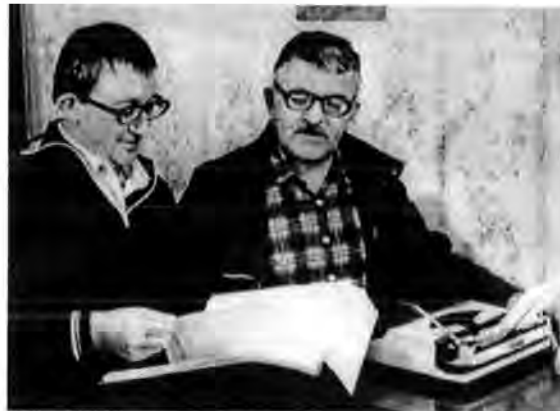
Fig. 3: Arkady Strugatsky (left) and Boris Strugatsky (right) at work

What followed is a literary career which has no equal in the genre of science fiction: two authors writing all their major works in tandem over a period of more than thirty years. This seems even more interesting if one considers that the two brothers did not live together, but in different towns no less than 650 km apart (Arkady in Moscow and Boris in Leningrad / Petersburg). Throughout their working life they met in Bologoye - a provincial town halfway