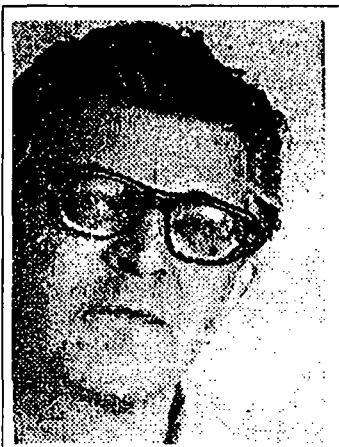
Fig. 1: Arkady Natanovich Strugatsky ( Аврора ; 1981, no. 2, p. 150)

The brothers Arkady Natanovich and Boris Natanovich Strugatsky are indubitably the best-known Russian science fiction authors. By the death of Arkady Strugatsky in 1991 they had written twenty-five novels and novellas (повести), besides plays, articles, critical works and numerous short stories, which have been translated into more than twenty languages (including, interestingly, Esperanto!). They provided film scripts for Alexander Sokurov's Дни затмения (Lenfilm, 1989), which is based on their short novel За миллиард лет до конца света , and Andrey Tarkovsky's most famous film Сталкер (Mosfilm, 1979), adapted from their short novel Пикник на обочине . Grigory Kromanov's Отель "У погибшего альпиниста" (Tallinfilm, 1979) is based on their novella of