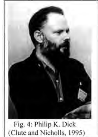
Fig. 4: Philip K. Dick (Clute and Nicholls, 1995)

As exotic as the idea of a dangerous Martian flying leech sounds, it cannot in my opinion be regarded as a science fiction motif. It is not the distinct new idea that, for science fiction, is the essential ingredient, as Dick puts it in a letter to John Betancourt (Dick, 1995: 9-11). The fact that the setting is exotic does not amount to a challenge of accepted values, morals or political beliefs. In fact, not only is this type of space adventure not subversive, it is, on the contrary, conservative, by its transference of the values accepted by the Soviet reader to a different environment (in time or space) and the assumption that they are still valid. A case in point is the rather militarist approach to the troubles with the flying leeches, which, although they are an almost completely unknown alien species, the scientists decide to hunt down and kill: