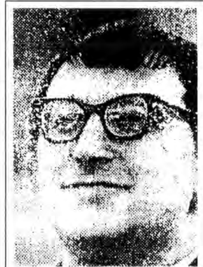
Fig. 2: Boris Natanovich Strugatsky (Аврора: 1981, no. 2, p. 150)

Boris Natanovich Strugatsky was born on April 15, 1933 in Leningrad. He studied astronomy from 1950 to 1955 at Leningrad University and worked in the Pulkovo observatory as an astrophysicist and specialist for data processing till 1965. He lives in Petersburg .