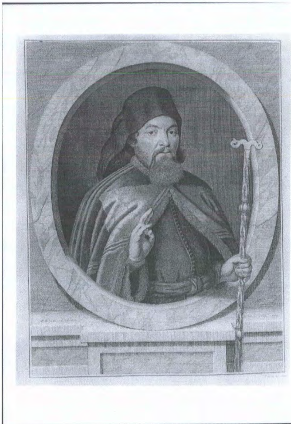
Figure 13- Archbishop of Philopoli, Robert White. Pepys Collection. 2980/132