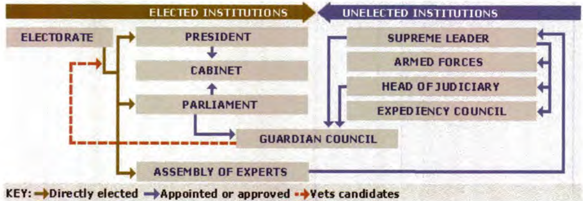
Figure 4.1: Composition of the Iranian Hierarchy

1989 due to the disjunction between the institution of the President and that of the supreme leader.