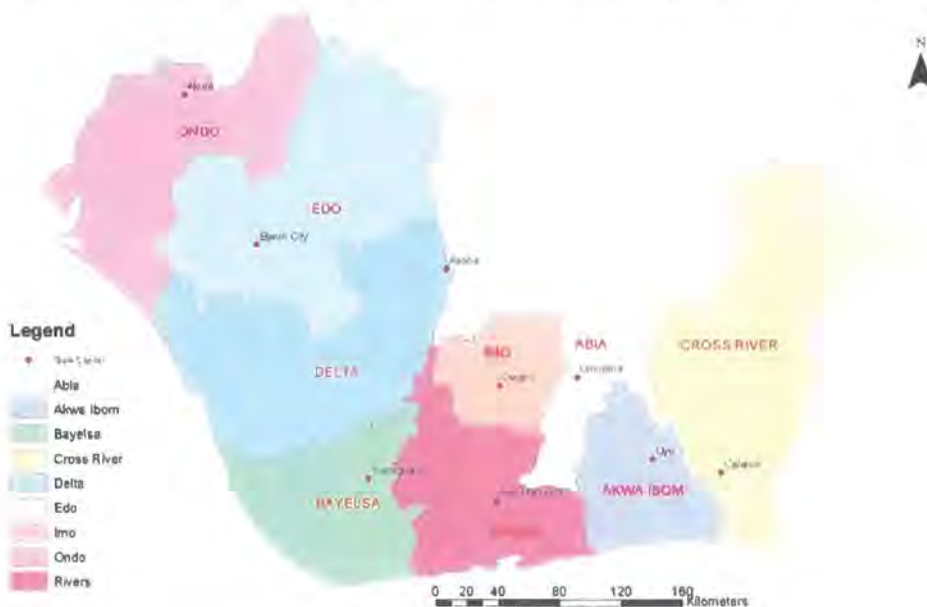
Figure Two: A Map showing member states of the Niger Delta Areas of Nigeria

The FCU equally raised a number of vital issues, which are discussed in turn below.