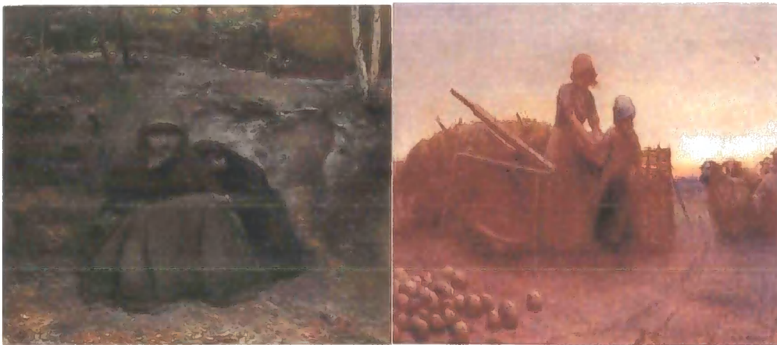
The conventional gender relations depicted in Arthur Marsh's work. Above: 4.11 The Wayfarers (1879) and 4.12 The Turnip Cutter (1902), Below: 4.13 The Worker (n.d.) and 4.14 The Ploughman Homeward Plods his Weary Way (n.d.)

similar manner in The Turnip Cutter (1902), which showed a woman and her daughter working early in the morning, or late at night, alone and outside. This picture certainly was not conceived as a celebration of female labour, as it emphasized the uncomfortable surroundings and the endlessness of the task-in the huge pile of turnips yet to be cut. There is none of the defiant dignity of female rural labour shown in Clausen's early depictions of Susan Chapman. In contrast to these, Marsh's The Ploughman Homeward Plods his Weary Way (n.d.) and The Worker (n.d.) depicted the male breadwinner returning home from a day's physical work. In this painting Marsh painted the man standing on the threshold of his home, illuminated from behind, with his pick held aloft as a sign both of his work and his masculinity.