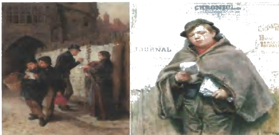
Local poverty in 4.5 Ralph Hedley The Ballad Seller (1884) and 4.6 Ralph Hedley The Newsboy (1892)

Local visual detail was used by most Northumberland artists in the 1880s and 1890s and was linked to the adoption of Naturalist or Realist techniques. However, local detail in depictions of architecture and landscape had not been uncommon in Northumberland's artistic output throughout the nineteenth century, it was now being used to 'place' everyday scenes and therefore give them a greater authenticity and impact for local audiences, rather than merely as picturesque detail.