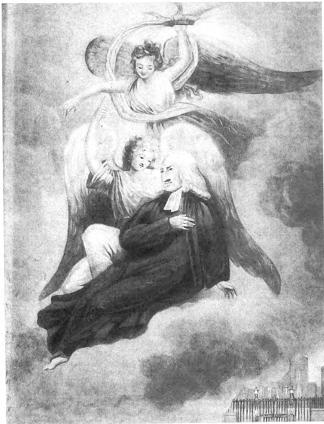
John Wesley carried up into heaven. Unknown artist, 1791. The John Rylands University Library, Methodist Images Collection.