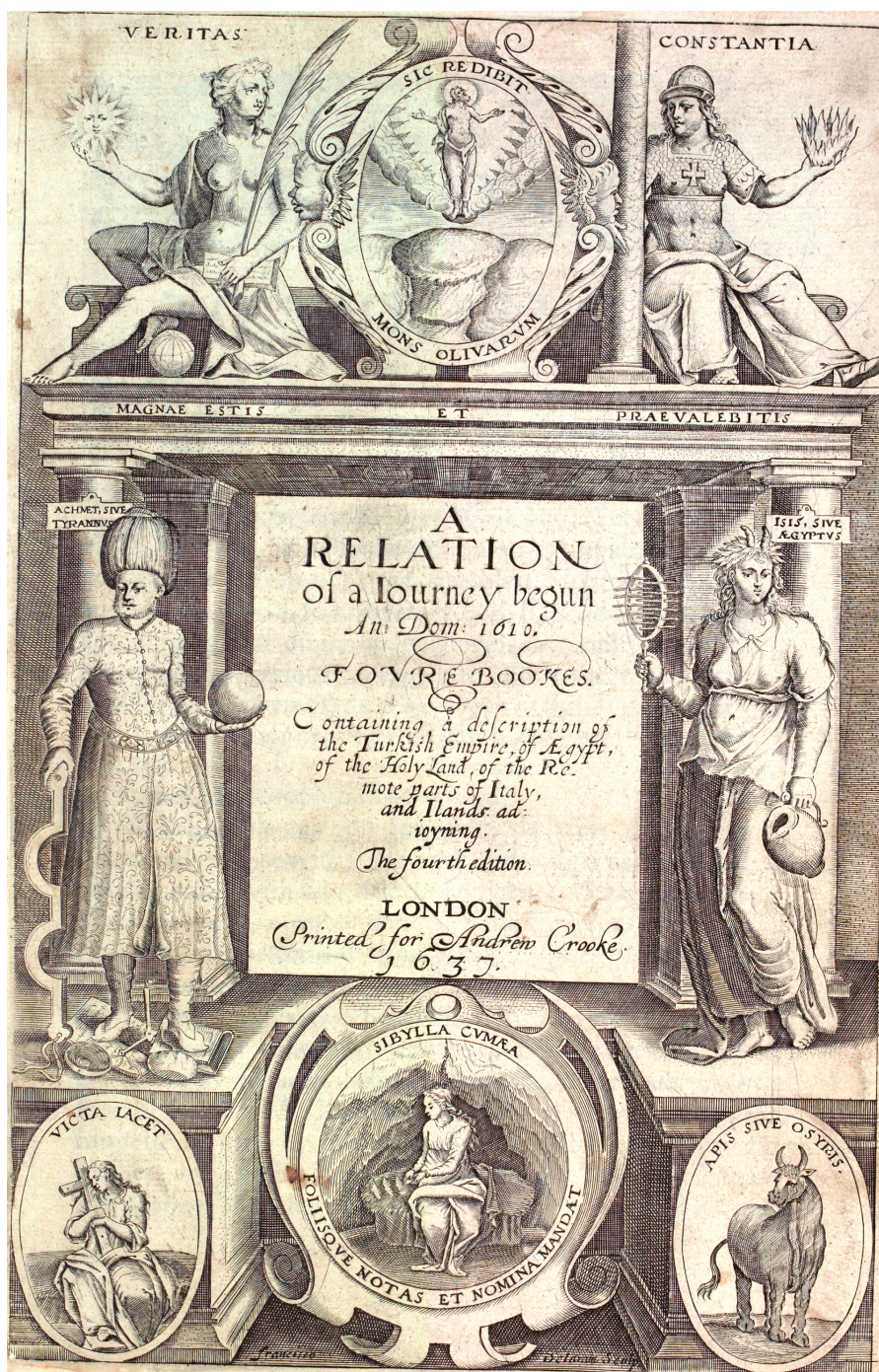
Figure 2: frontispiece to Sandys' Relation (1637), by kind permission of the Trustees of the National Library of Scotland.