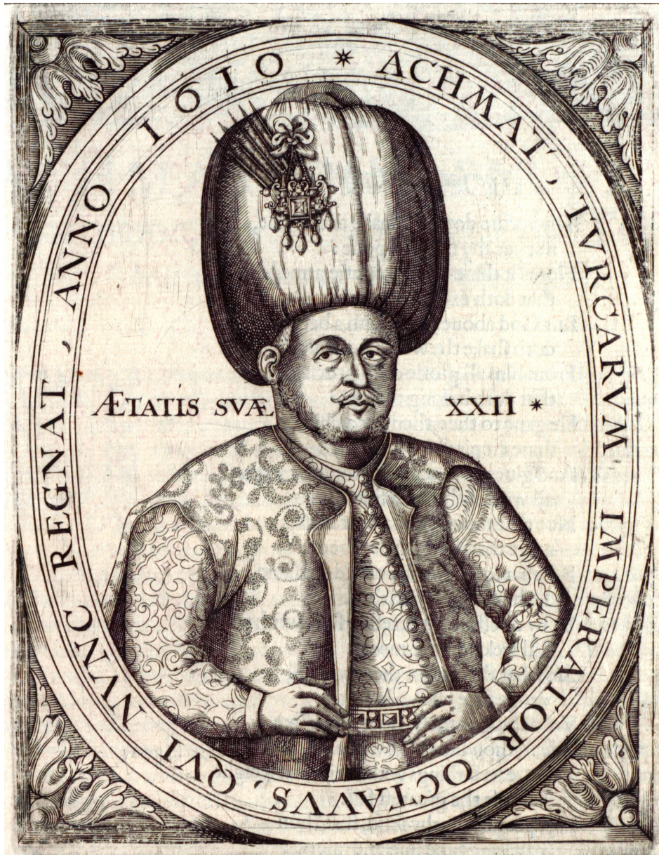
Figure 1: 'Achmat, the first of that name, eight Emperour of the Turks'

Knolles, History (1610), p. 1203, by kind permission of the Trustees of the National