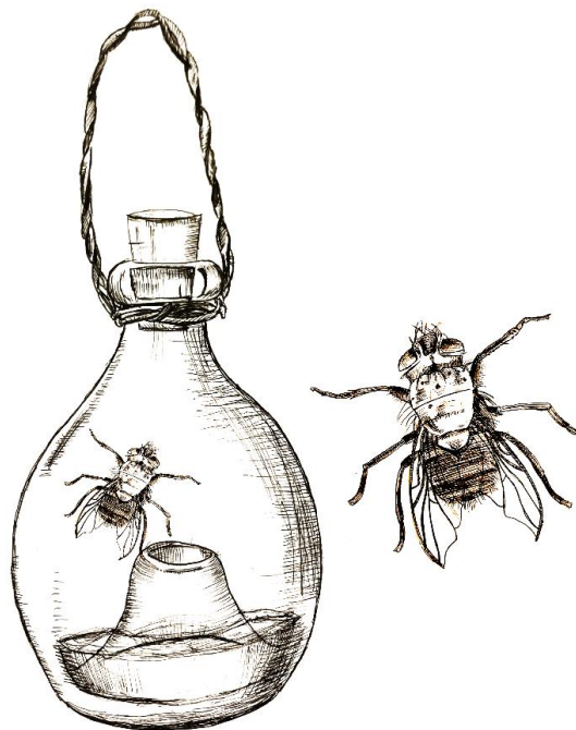
Figure 1: Fly bottles are designed such that the conical entrance is small and dark. 411

When Wittgenstein says that the purpose of philosophy is “To shew the fly the way out of the fly-bottle.” (PI, 309) what change happens to the metaphorical insect?