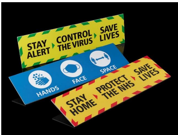
FIGURE 16: Downing Street lectern signs. © The Board of Trustees of the Science Museum. Released under a Creative Commons Attribution - Non Commercial - Share Alike 4.0 Licence: https://creativecommons.org/licenses/by-nc-sa/4.0 (Science Museum Group, 2020)

attendant messages ‘dangerous behaviour’, ‘stop’, ‘evacuate’; yellow is a warning signal which conveys the messages ‘be careful’, ‘take precautions’; and blue signage indicates that the attendant behaviour or action is mandatory. Green indicates ‘no danger – return to normal’ and identifies escape routes. The slogan: ‘ Stay home. Protect the NHS. Save lives. ’ became familiar on the Downing Street lectern, displayed in black type on a yellow background with red stripes. The slogan was used from the imposition of ‘lockdown’ until 10 May 2020, when it was replaced by: ‘ Stay alert. Control the virus. Save lives. ’ and the red stripes were replaced by green. These signs were interspersed with the use of the blue and white ‘ Hands, Face, Space ’ slogan illustrated with simple graphics. The red and yellow ‘ Stay home ’ sign returned to the lectern during subsequent national lockdowns. The confusion and ‘opaque’ quality of messaging was discussed in an ITV news item one year on from the initial lockdown (Evans, 2021).