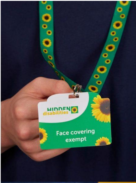
FIGURE 11: A Sunflower lanyard with information card (Hidden Disabilities, n.d.-a)

For those who did not wear masks, antipathy was anticipated from some mask-wearers. To defuse potential conflict, some participants with hidden disabilities adopted the use of a ‘Sunflower lanyard’ 6 (Figures 11 and 12) to indicate that their missing mask’s biography was a story of difficulty rather than of defiance.