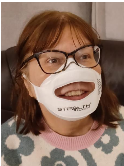
FIGURE 10: Me wearing an FFP3 mask with added window to allow visual access to the mouth. In Section 5.2.5, GP Deborah comments on the ‘odd’ aesthetic of the design of clear masks (Lambell, 2024e)