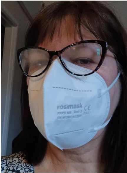
FIGURE 2: Me wearing an FFP3 respirator mask, with some misting on my lenses (Lambell, 2024b)

FFP stands for ‘filtering face piece’, and the 3 denotes a higher level of filtration. The Health and Safety Executive stipulates that people who wear an FFP3 mask must first undergo a ‘fit test’ to ascertain the correct size to provide a tight seal on the face and must subsequently only use that size and brand of mask (HSE, 2019). Some FFP masks have an exhalation valve to make it more comfortable to wear (Figure 3). However, while the valve maintains the ‘wearer protection’ function of the mask, the stream of out-breath released through the valve means the mask does not have a ‘source control’ function (Staymates, 2020).