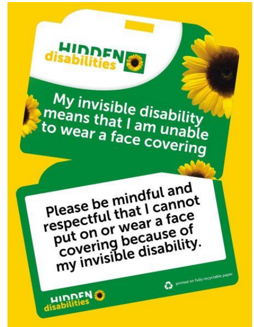
FIGURE 12: An alternative text option for the information card on a Sunflower lanyard (Hidden Disabilities, n.d.-b)