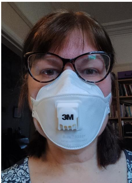
FIGURE 3: Me wearing a valved FFP3 respirator mask, no misting on my lenses (Lambell, 2024c)

FFP stands for ‘filtering face piece’, and the 3 denotes a higher level of filtration. The Health and Safety Executive stipulates that people who wear an FFP3 mask must first undergo a ‘fit test’ to ascertain the correct size to provide a tight seal on the face and must subsequently only use that size and brand of mask (HSE, 2019). Some FFP masks have an exhalation valve to make it more comfortable to wear (Figure 3). However, while the valve maintains the ‘wearer protection’ function of the mask, the stream of out-breath released through the valve means the mask does not have a ‘source control’ function (Staymates, 2020).