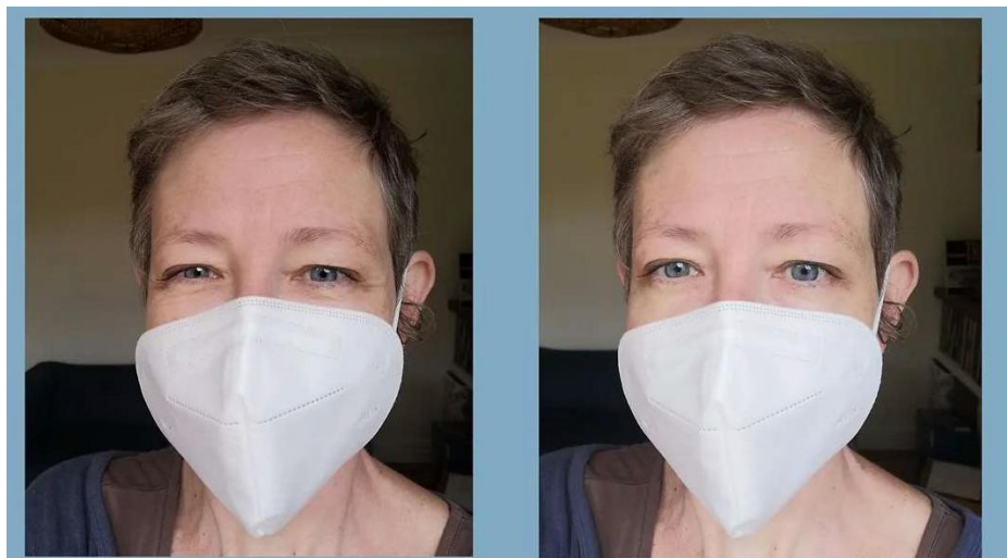
FIGURE 15: Duchenne smile (left) and non-Duchenne smile (right). Image: © Shelley Purchon (2020), reproduced with permission

A Duchenne smile (Ekman, Davidson & Friesen, 1990), named after French neurologist Guillaume Duchenne, engages the muscles around the eye to create what Carl observed in his carers as 'that sort of slight crease in your face' [32/415-29/10/20]. The difference between a Duchenne and non-Duchenne smile is apparent above a mask, as demonstrated by communication trainer Shelley Purchon in Figure 15 (Purchon, 2020).