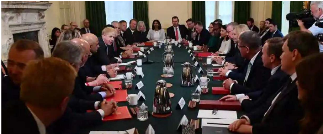
FIGURE 6: UK Cabinet meeting, 17 September 2021.

The confused signals caused by resistance to the rules by the people who made them are exemplified in this photograph of a UK government cabinet meeting on 17 September 2021 (Figure 6). Journalists were invited in to record the Cabinet ignoring its own guidance – the room is crowded, windows closed, and no-one is wearing a face-covering (P. Walker, 2021).