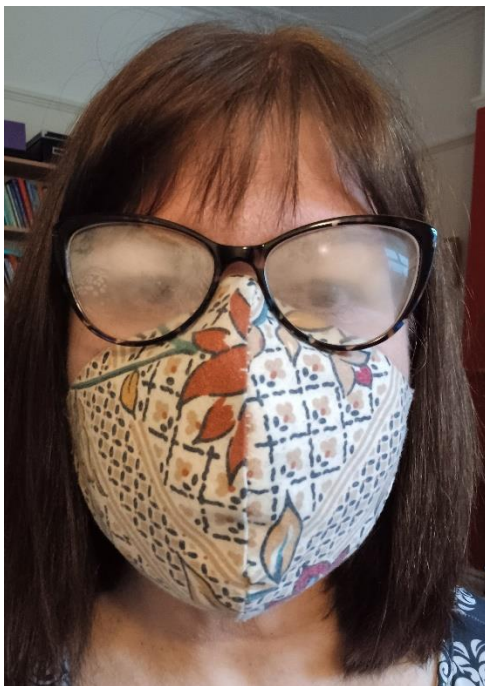
FIGURE 4: Me wearing my home-made face covering – with misted glasses (Lambell, 2024d)

Despite the differences, in common discourse the term ‘mask’ has been used as an overarching description for all three types of covering. The descriptions above explain their explicit purposes as stated by the manufacturers in compliance with the HSE. However, the communication of these purposes, and the meanings of the objects as interpreted by a wide range of stakeholders, was more complex and fluid. This is the subject of my research.