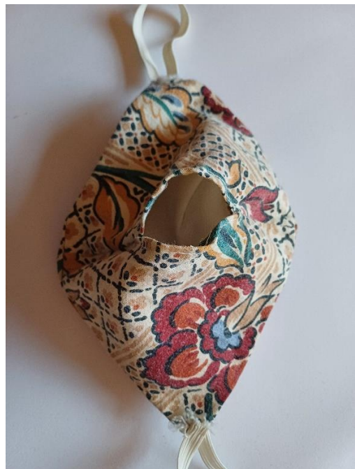
FIGURE 5: The inside of the mask, with its pocket for additional filtering gauze (Lambell, 2024e)