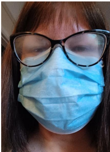
FIGURE 1: Me wearing a Type IIR surgical mask, experiencing the misting effect on the inner surface of my glasses from the mask funnelling my outbreath into my eyes (Lambell, 2024a)

My research concerns three kinds of PPE artefacts known collectively as ‘masks’: surgical masks, respirators, and face coverings.