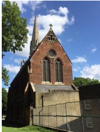
St. Mary Magdalene, Paddington