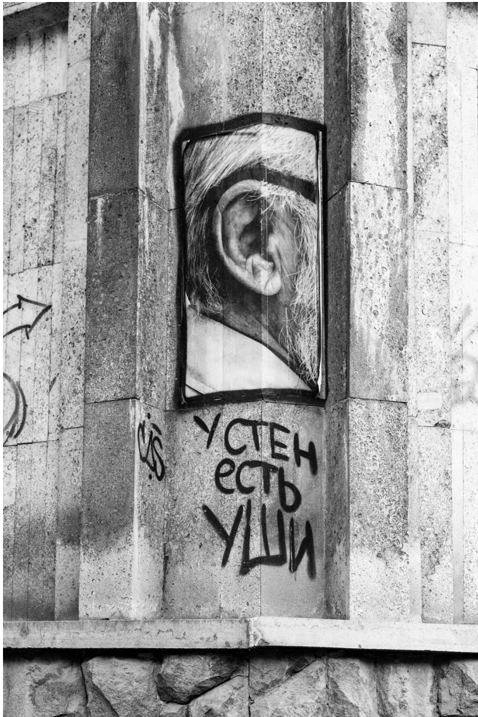
Image 5.2: Graffiti text reads, ‘The walls have ears’. Image taken by author in downtown Almaty, 2015.