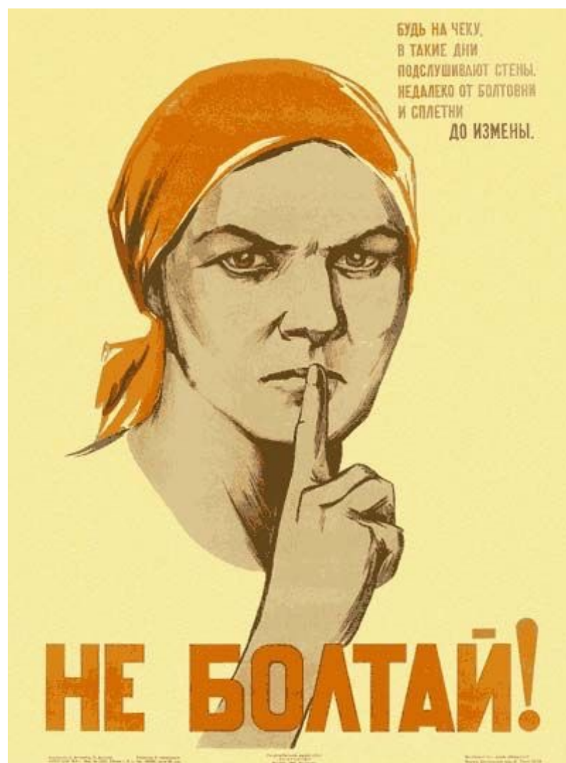
Image 5.3: WWII Soviet propaganda poster. Text reads, 'Don't gossip! Be aware, these days, walls can overhear you, treason is not far from empty chatter and gossip'.