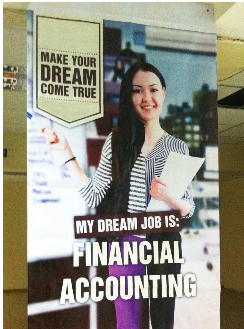
Image 5.1: A promotional banner at a private university in Almaty advertising their Financial Accounting degree programme. University branding has been removed. Taken by author 3 September 2015.

For the answer, we have to look to wider societal efforts to re-image the present. I argue that the post-Soviet ‘homo-economicus’ is an enduring type that renews and refreshes itself with each generation as long as the public goals of society, framed in the government’s nation-building narratives, remain focused on economic growth and prosperity. We can see a Kazakh example of this in how the government has undertaken the rebuilding of Astana (renamed Nur-Sultan in 2019) to be, at least in appearances, a skyline comparable to other international capital cities (Bissenova, 2013; Laszczkowski, 2016). In Yurchak’s description of Russia’s new rich, he encapsulates the post-socialist situation I describe: ‘Indeed, while you are forging, molding a career for yourself, you are also forging, or counterfeiting, a neoliberal model of meaningful life that looks almost like “the real thing,” only without the “trivialities” of human ethical dilemmas’ (Yurchak, 2003, p. 90).