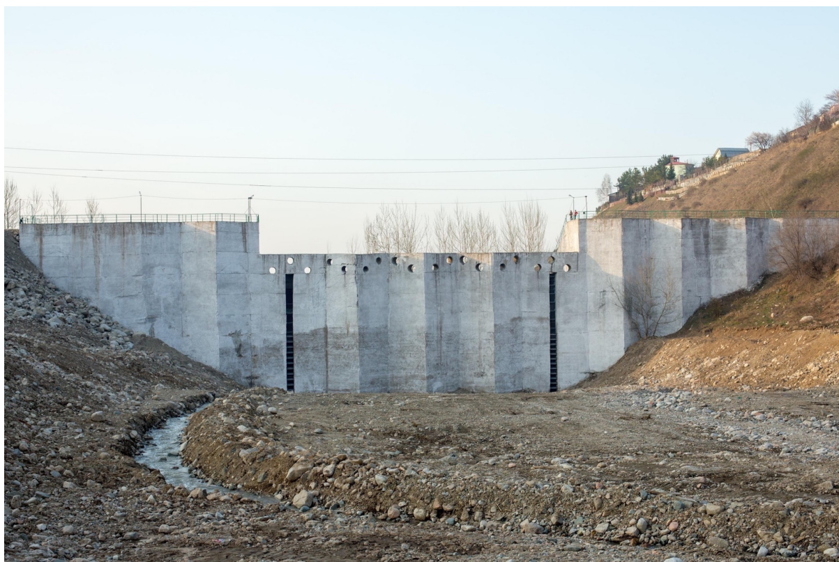
Image 4.2: Anti-mudflow dam on the Kargalinka River after the sel .