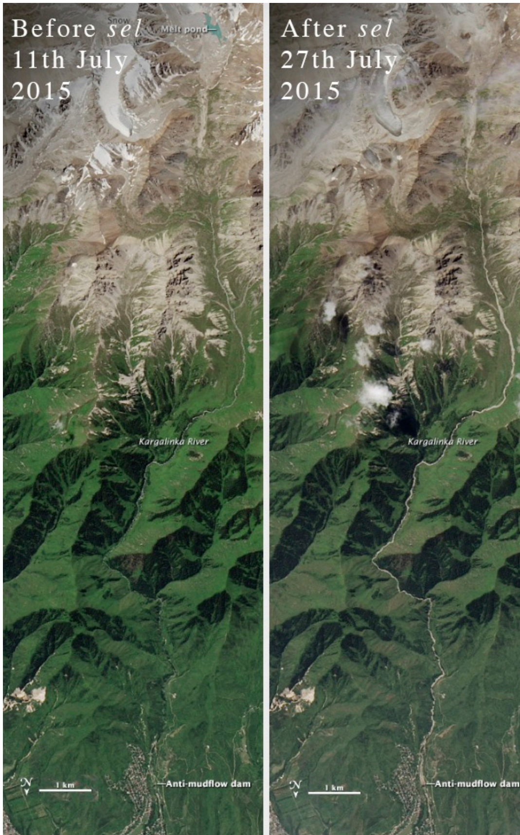
Image 4.1: Before-and-after comparison of floodwater in the Kargalinka River.