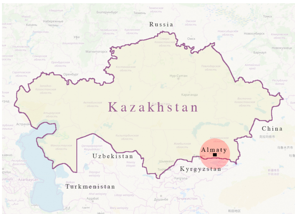
Image 1.1: Map of Kazakhstan showing the location of Almaty and the names of countries that share a land border.

Kazakhstan is the ninth largest country in the world, yet it is still relatively unknown and understood in the West. This vast country covers many ecological zones, including mountains, steppe, and desert. There is a severe continental climate with extreme lows of -45^{\circ} Celsius in the winter and high temperatures of up to 50^{\circ} Celsius in the summer months. My research was carried out in and around the city of Almaty, in the southeastern corner of Kazakhstan, close to the mountainous border with Kyrgyzstan and 300 kilometres from a border crossing into Northwest China (Image 1.1). In Chapter 3, I include a detailed map of the city of Almaty and locate my research activities in the context of the city districts (Image 3.1). Almaty is built in a seismically active area, and there are multiple faults running under the city which have the potential to cause significant earthquakes. The city has suffered in the past from major earthquakes in 1867 and 1911. The city is also vulnerable to flooding from the multiple river channels that cross the city, as well as to landslides and mudflows from the steep slopes in the southern edge of the city that rise up into the Tian Shan mountain range.