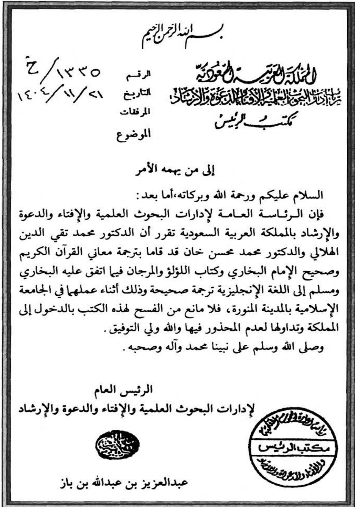
Figure 1. Ibn Bāz's Letter.