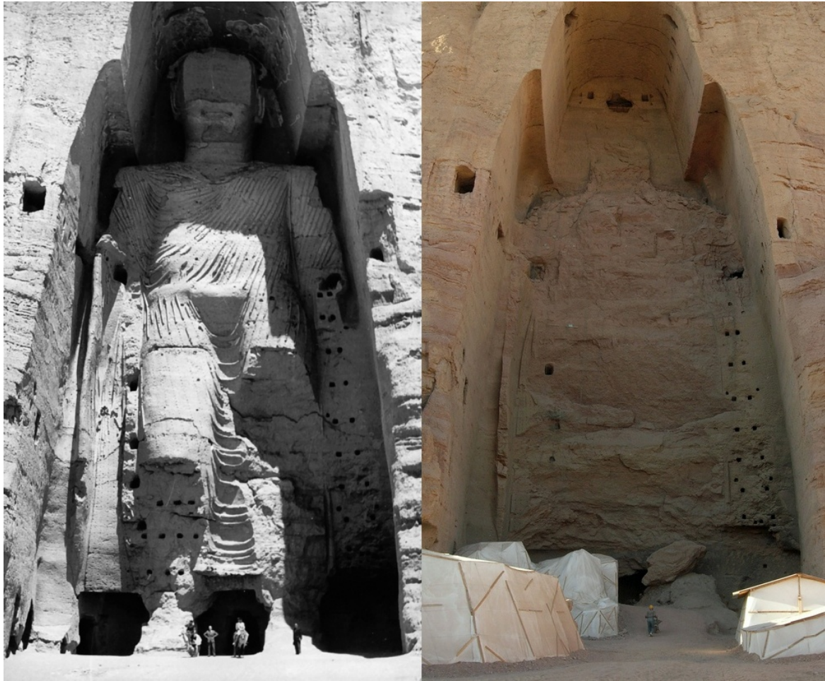
Figure 1: The Buddhas of Bamiyan 1963 (Left) & The Buddhas of Bamiyan in 2008, post Destruction (right) 36

Meanwhile, in the Taliban's case, their ownership claim comes from them assuming territorial ownership of the region the Buddhas were in, and their justification for destroying the shrines came from their Islamist stance that images of other religions should be destroyed. The shrines were produced by a now extinct nomadic Buddhist community centuries ago, who produced them we assume, to stand the test of time rather than to be destroyed (Colwell-Chanthaphonh, 2009, p140). An archaeologist would be justified, in Foot's framework, to obstruct this example of iconoclasm. By obstructing the Taliban, they would have obstructed an action spurred on by a belief system that prioritises religious doctrine over a commitment to human wellbeing. To do