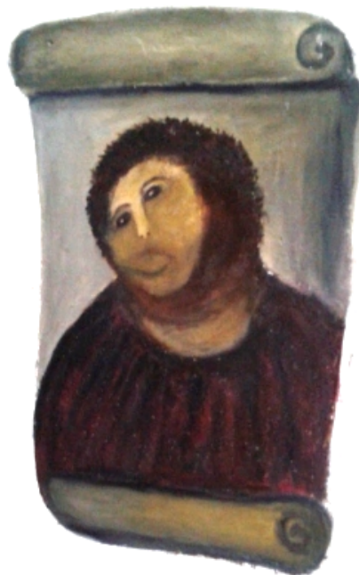
Figure 3: Ecce Homo after “restoration” 42