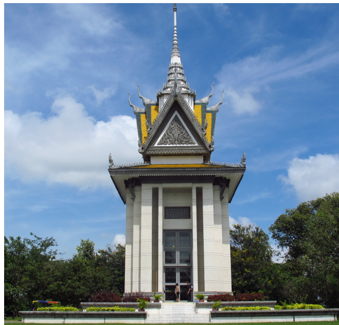
Figure 4: Choeung Ek Memorial 71

By “proportionally” I mean in a manner that motivates them to being a eudaimonic force: one does not demonstrate virtue merely by being emotional at parts of the past. Imagine four tourists went to Choeung Ek (see below). This is a memorial to the victims of the Khmer Rouge, a shrine that contains over 5,000 skulls exhumed from one of the mass graves of the Khmer Rouge’s infamous Killing Fields. The four tourists are told of the history of the Khmer Rouge’s genocides, and each reacts differently.