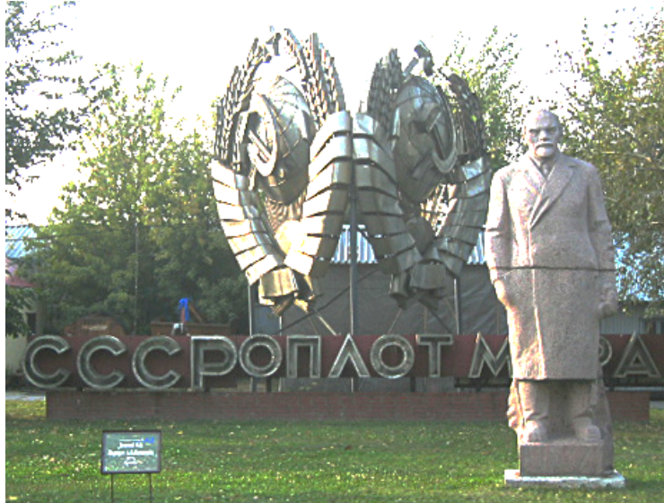
Figure 5: Monuments in "The Fallen Monument Park" in Moscow 73

prominence and put into “soviet parks” (see figure 5, below) (Harrison, 2013, pp 194-196). This was done by the various states’ governments so as to ensure their citizens can access the eudaimonic good that is knowledge of the past, but are not constantly forced to dwell on the traumatic past.