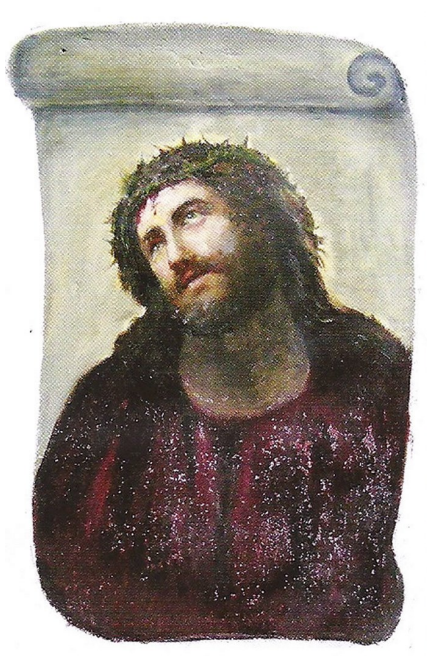
Figure 2: Ecce Homo prior to “restoration”

Firstly, on conservation. In appreciating that awareness of the human past is a eudaimonic good, we are led to valuing phenomena that can promote an awareness of the human past, including scientific awareness of the human past. For the archaeologist, the loss of an article of human heritage, be it from decay or destruction, is an irreparable loss of something they could have used to fill the blanks in the scientific account of the human past. When we hear stories of iconoclasts destroying examples of human heritage, or tales of some well-meaning amateur taking it upon themselves to restore some artefact, it is right that we view this with moral controversy, for their actions have led to the irreparable loss of something that is good for the human animal. The woman who elected to “restore” an antique portrait of Christ in Zaragoza (see below) before deciding it was perhaps best to have left the job to a more qualified individual, did more damage than merely ruin a painting; she made it that this piece of heritage will likely never be restored properly. More than that, she also contaminated the portrait with her own paints, complicating any future archaeologist’s research on the artwork 41 .