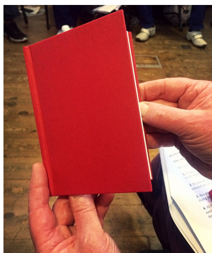
Picture: One of the red notebooks handed out.

After this, the group disbands. Leader makes sure that participants take home all the remaining food, and I thank her again for allowing me to attend the session.