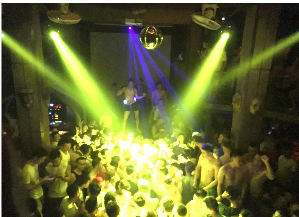
Figure 6: G.O.D (the 'nude' landscape)

in G.O.D. is deliberate on the part of the club owner as Gun assumed, this heat did result in this club's 'nude landscape'—most patrons being topless (see Figure 6). This particular landscape not only legitimises the transgressive practise of being semi-naked in public but also incorporates it as a norm of this club. This norm increases the degree of the liminality in G.O.D. that, as Gun indicates, leads many muscular patrons to be semi-naked and fosters an erotic atmosphere, increasing body contact and stimulating further sexual interactions. In contrast, because the temperature in DJ Station is usually cool most patrons dress as neatly as they would ordinarily, which decreases the degree of liminality and thereby the legitimacy for its patrons to initiate transgressive sexual practices.