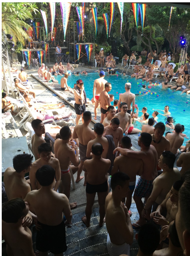
Figure 1: Gay Sauna- Babylon (before the Foam gathering)

After dinner, many participants then continue their sexual adventures through heading for a go-go bar— another form of space/prostitution which combines a set of performances includes go-go dance show, lip-sync, comedy separated by interludes of the ‘catwalk’ of nearly naked go-go boys who wear only sexy briefs with number tag on it (see Figure 2 and Figure 3). 8 In this kind of space, clients can merely watch the show by themselves or order the go-go boy to accompany them. If clients like the boy they ordered, they then could pay a given amount of commission fee to the owner of the bar to ‘take away’ this boy for further sexual interactions or company. The sexual adventures of participants mostly ends up with going to gay clubs around midnight (see Figure 4). In clubs, they not only