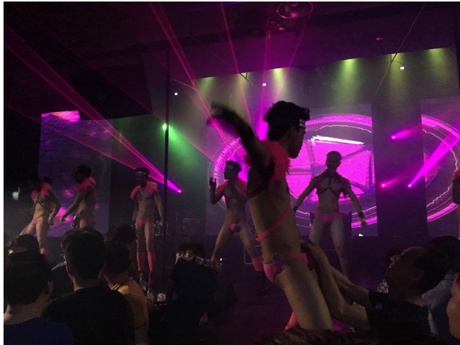
Figure 2: Go-go dance (FAKE club)

hang out with friends but also watch and are watched by or even flirt with strangers from which many romances or sexual encounters are initiated.