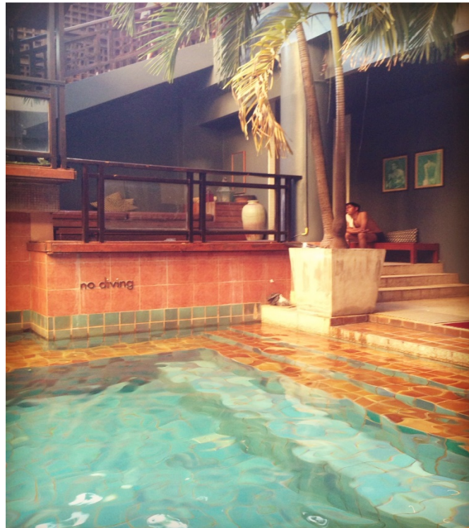
Figure 7: Sauna Chakran (courtyard)

others' sexual desirability through touching, so muscular and well-endowed men have the most advantageous forms of sexual capital here. Since Rabbit's slender frame does not match Mania's structure of desire, he was not treated as a sexually desirable subject in this sauna, which was evident in the number of men who followed him and how conventionally attractive they were.