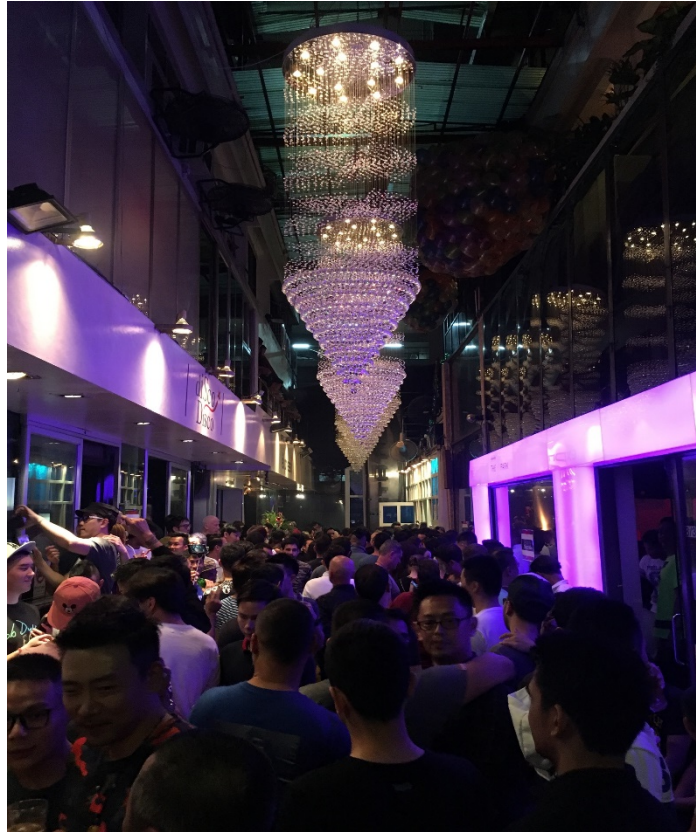
Figure 5: DJ Station

Secondly, the type of music clubs play also leads to notably different degrees of liminality between them. While DJ Station usually plays pop music such as hit songs from gay icons including Britney Spears, Lady Gaga and Beyoncé, many participants mentioned that they usually focused on activities such as lip-syncing these songs and dancing gently. These activities made them maintained a proper distance with others, which decreased the degrees of liminality and hence the possibilities of engaging in casual sex with strangers afterward. Contrastingly, when it comes to G.O.D., as Gun argues, the strong beats of techno music that play through the mega bass loudspeaker indeed amplified its patrons' rhythm, which caused frequent and intimate body contact among them and led to further sexual interactions in the club or one-night stands.