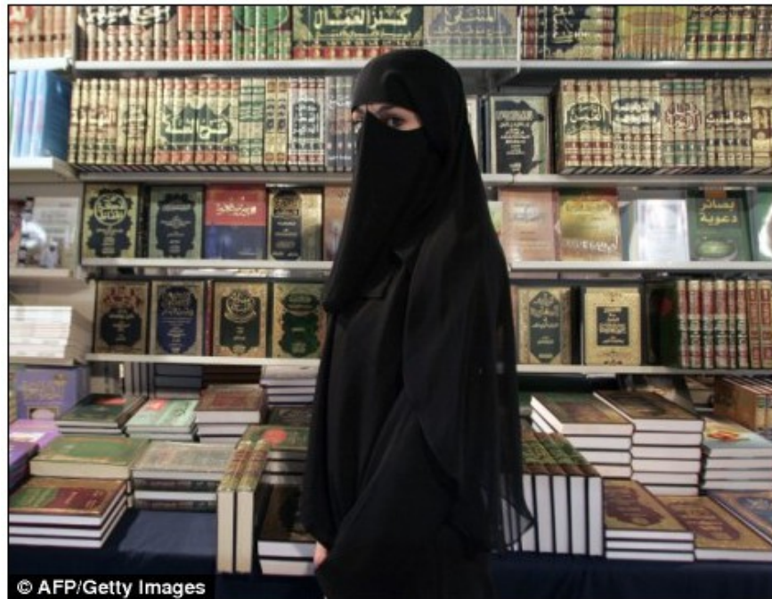
Burka ban: French MPs are expected to recommend that Islamic veils, as seen on a woman in Paris, are not welcome on public transport or in civic buildings