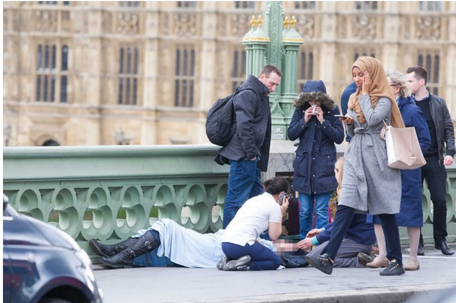
Image 18: The hijab-clad woman on Westminster Bridge

She also reported severe online abuse “by those who could not look beyond [her] attire” and drew “conclusions based on hate and xenophobia.” (Tell Mama, 2017).