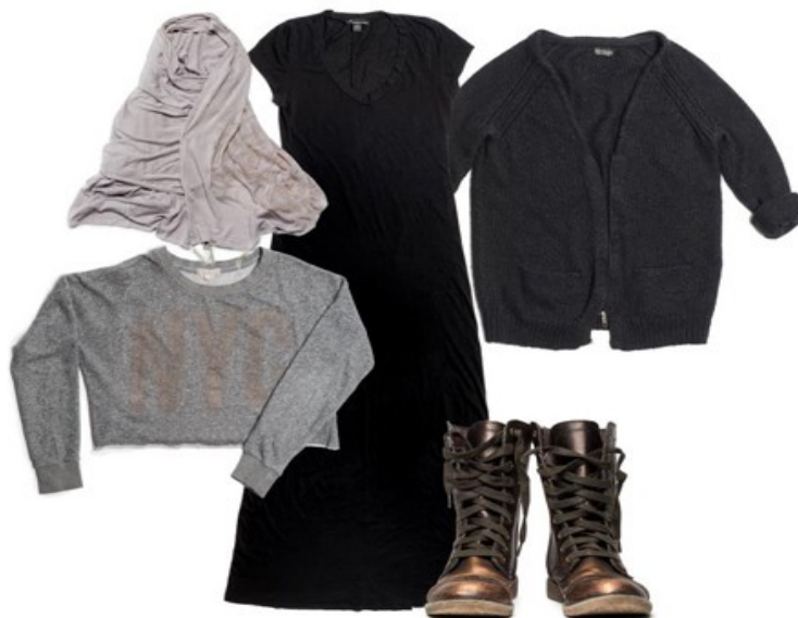
Image 9: Hiba's fashionable outfit based on the principle of layering high street items

Interestingly enough, all four of the outfits were premised on the principle of layering and were assembled from mainstream pieces that would not traditionally be perceived as Islamic.