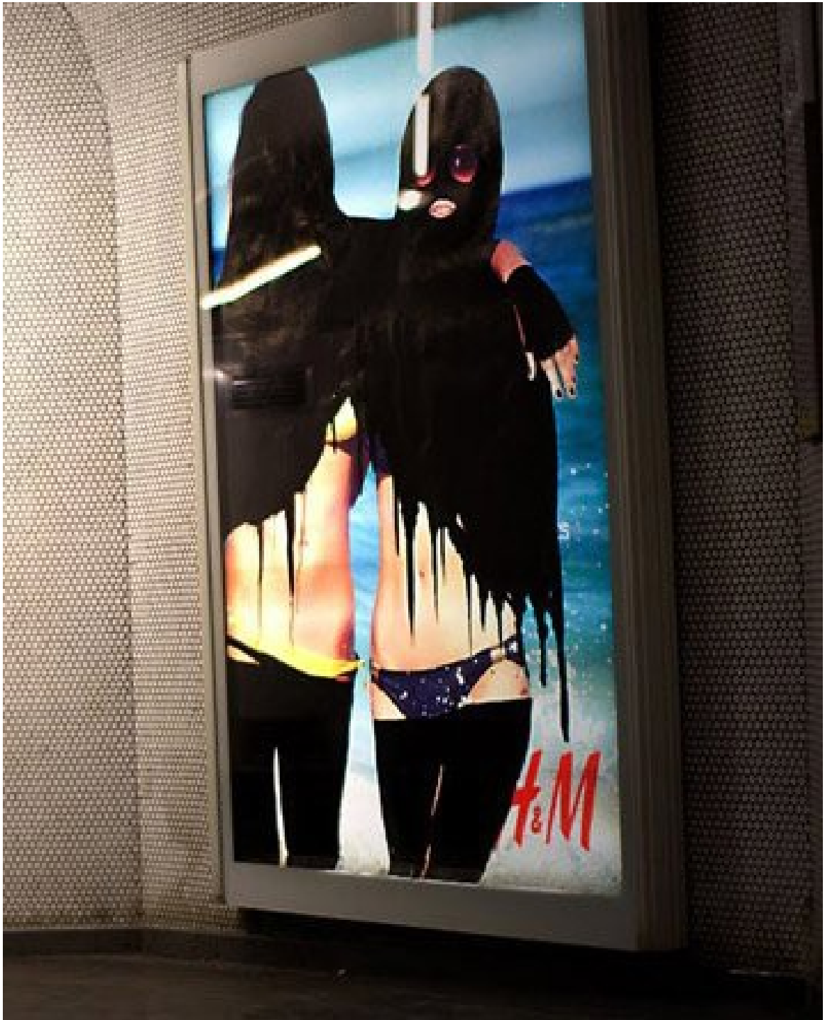
Image 8: Princess Hijab's anti-fashion in the Paris metro