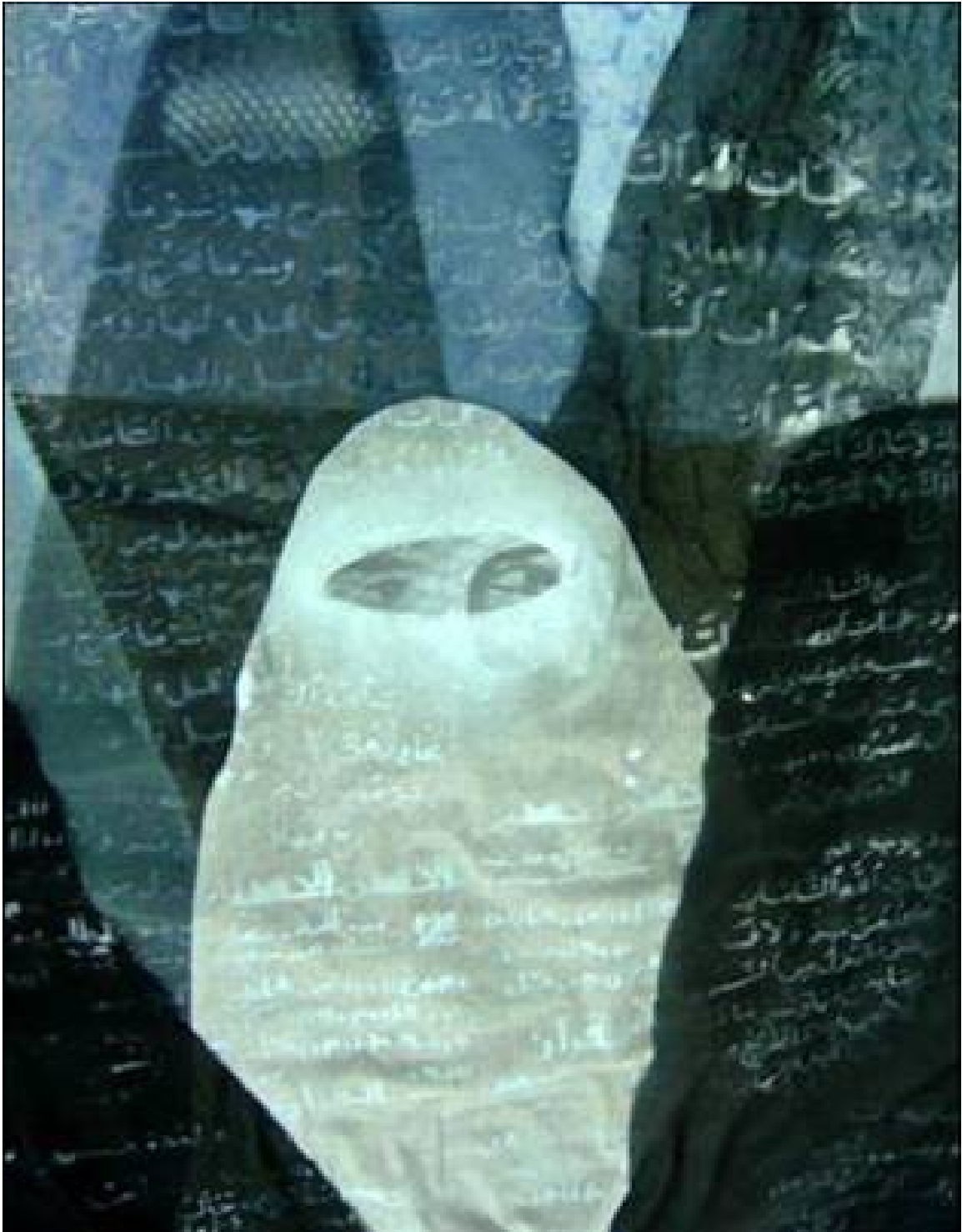
Image 12: Georgina Choueiri – A detail from an artwork Veils Mural