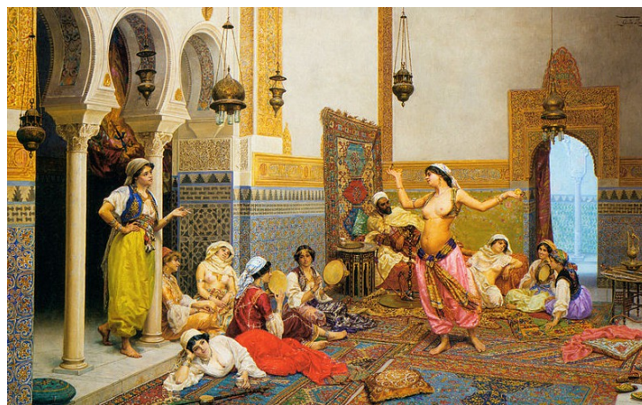
Images 2 and 3: Outside and inside harem: harem walls and the veil are protecting female privacy and sexuality in colonial Orientalist imagery ('Harem Women Feeding Pigeons in a Courtyard' by Jean-Léon Gerome and 'The Harem Dance' by Giulio Rosati)

The colonial construction of veiling is often seen in connection to the counter-image of the harem. Taking into account that the harem, the women's quarters in a house, was embedded in a private domain – and a female private domain for