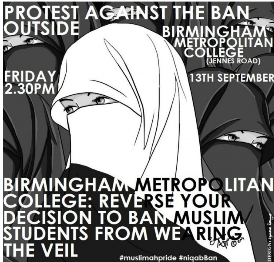
Image 16: A leaflet calling potential protesters to join the rally against the burqa ban at Birmingham Metropolitan College