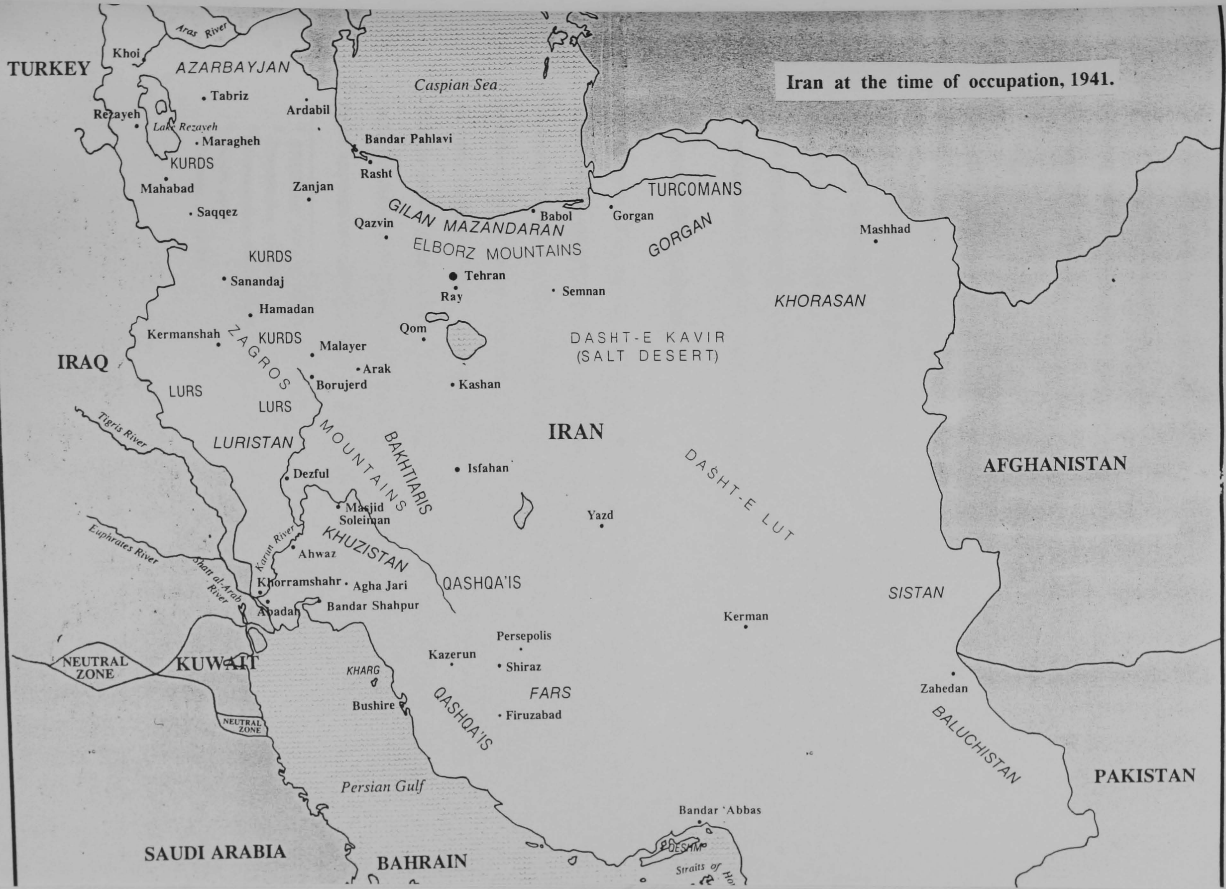
Iran at the time of occupation, 1941.