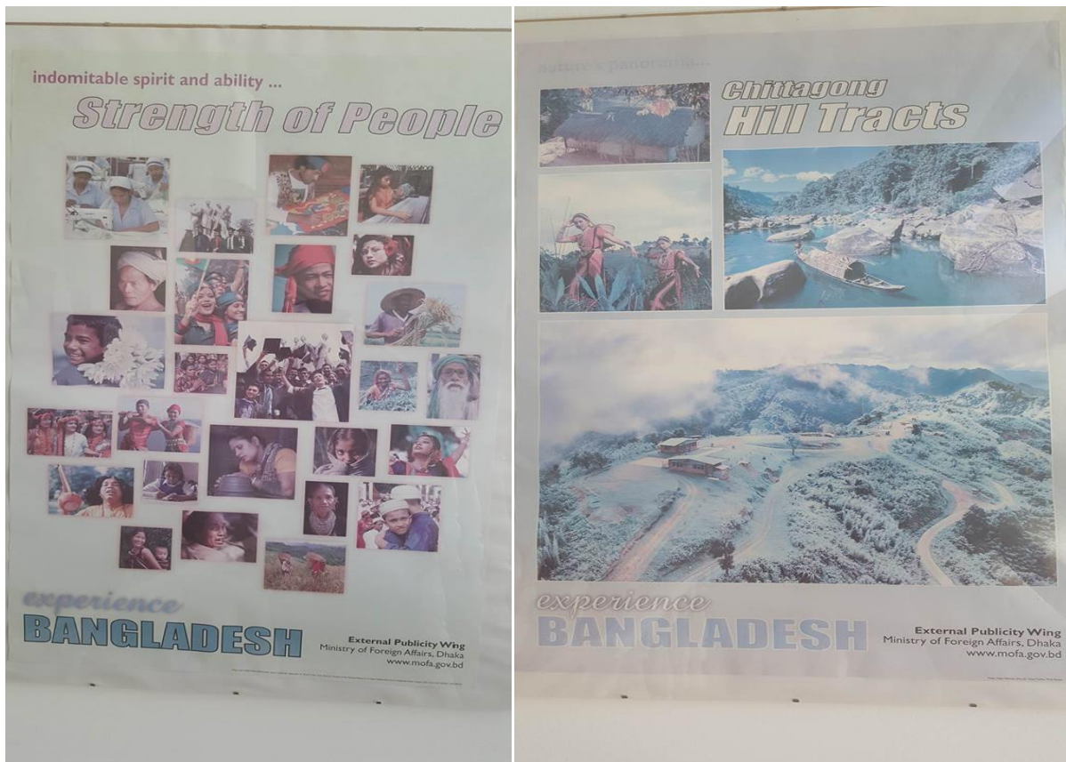
Photo 1: The photos, taken by me, of two posters on display at the Bangladesh Embassy in Lisbon

I came across these posters in the Bangladeshi Embassy in Lisbon which are published by the External Publicity Wing, Ministry of Foreign Affairs. These posters encourage the foreigners to experience Bangladesh and indigenous people are central to these posters. A video 5 entitled 'Beautiful Bangladesh: Land of Stories' and made by the Bangladesh Tourism Board also features the water festival 6 of Marma communities in the (CHT) to attract tourists to Bangladesh. The government of Bangladesh circulated stamps (2010) using the image of the indigenous community' living in Bangladesh where the figures of the indigenous women 7 have again been central.