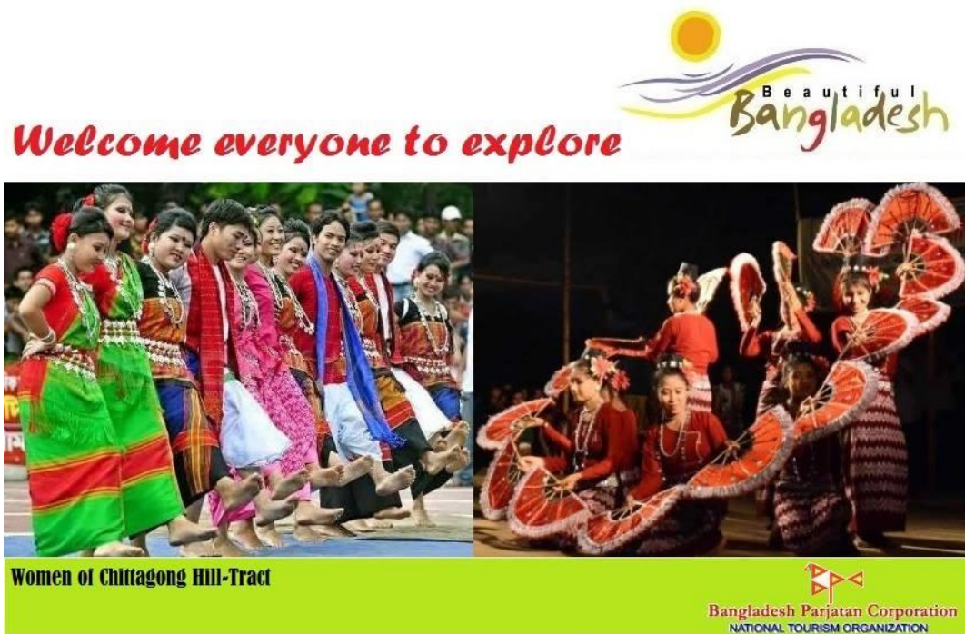
A poster on display at the Shahjalal International Airport in Dhaka promoting tourism in the Chittagong Hill Tracts. Caption: Women of Chittagong Hill Tract.