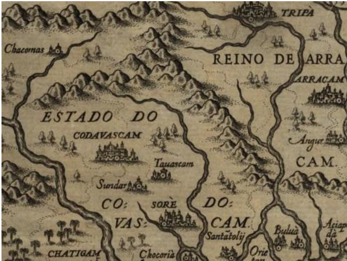
Photo 6: Sixth century Portuguese map showing the Chacomas kingdom in present-day Rangamati north of Arakan 53 .

The hill groups originally living in the coastal plains of Chittagong had to withdraw to the interior hills after the Mughal conquest of Chittagong. This period represents a turning point in the history of the ethnic hill groups and Bangali power in Chittagong. The indigenous groups had been living in comparative segregation from the population in the plain since their retreat into the hills, until 1860 when British administrators annexed the CHT areas. In spite of their isolation from, and hostility to, the plains, the Chakma chiefs (from 1725 to 1757) and the Marma chiefs had always maintained trade relations with the plains and paid compliments or trade taxes to the Mughals.