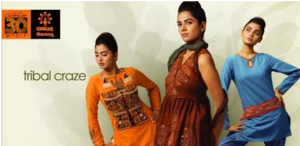
Photo 10: 'Aarong' used the indigenous theme in their poster 'Tribal Craze' (29/11/12)