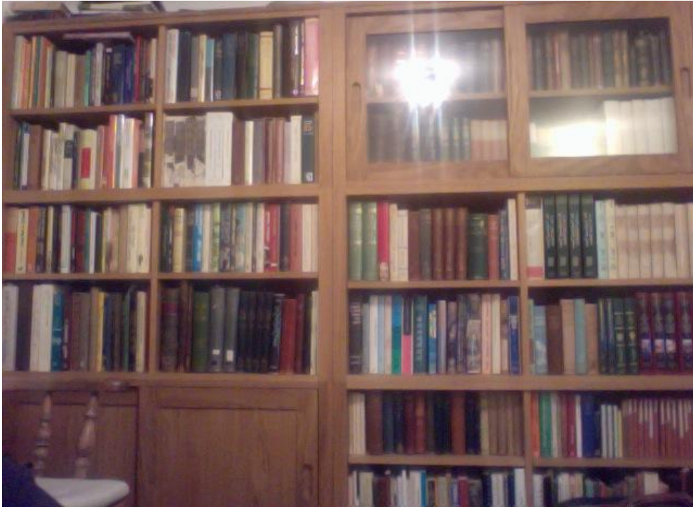
Figure 13: Part of the Davenport's extensive personal collection

information. 164 They also claimed to have a large number of books, and regularly to buy more, including duplicates of those they already have, "if the price is right". Their aim is then to offer their duplicates to young musicians for them to improve and find inspiration.