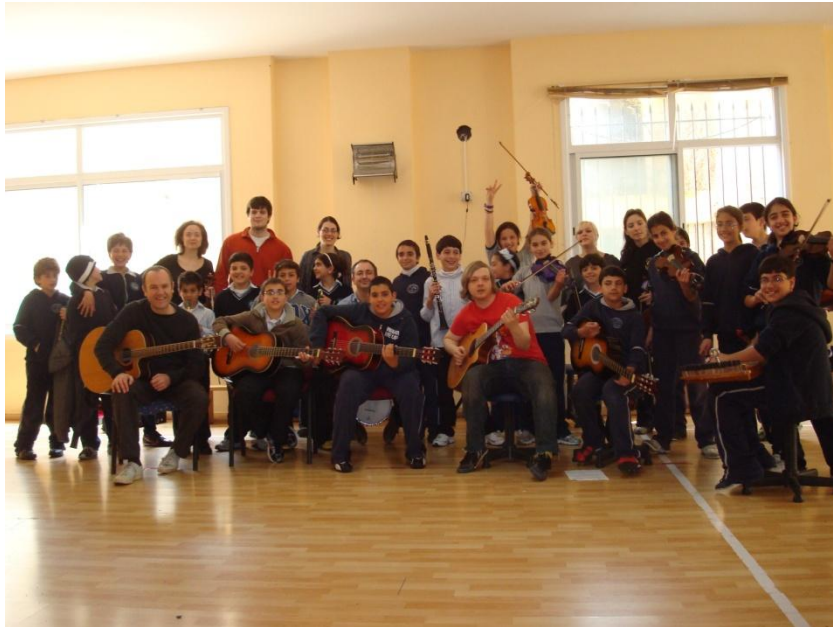
Figure 3: The Ceilidh Beyond Borders project in Nablus, April 2011

context, the folk-style urge to adapt remained apparent, and was clearly revealed when the various classes all assembled to perform together; as the heterophonic folk sound rung out, I even noticed that some of the students were already subjecting what they had learnt to simple revisions – leaving out and adding notes.