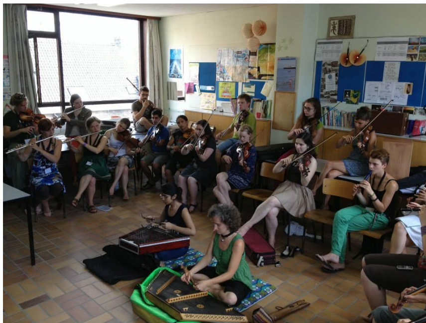
Figure 6: A classroom workshop for "melody" instruments

The variety of venues in which rehearsals and other events take place, both formal and informal, also play a role in determining how people interact with one another – some spaces, for example, encouraging focus upon the “teacher” and others encouraging a less hierarchical arrangement. However, crucially, no organised seating plans are imposed, until the very last rehearsal when the set-up for staged concerts is established.