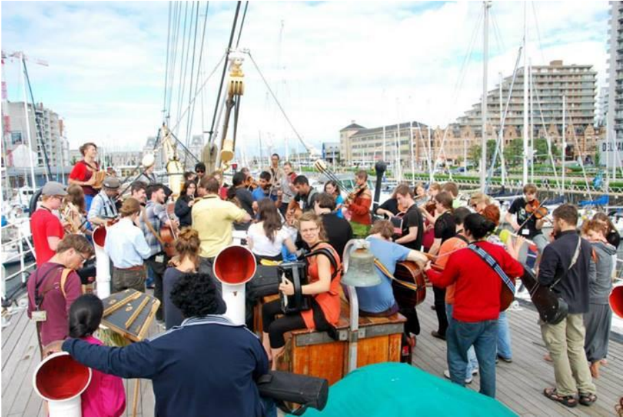
Figure 7: The boat excursion

more "interesting" locations are also designed both to alleviate the monotony of the school setting and actively encourage exchange between participants.