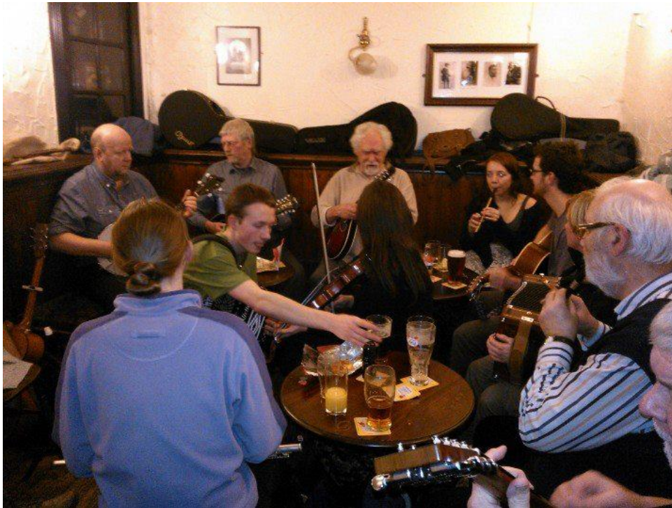
Figure 12: A Wednesday session at the Shakespeare pub, Durham (February 2013), including singers as well as players.

associated sentiments. Over the course of the evening, the participants take themselves through a range of emotional states and types of interactivity.