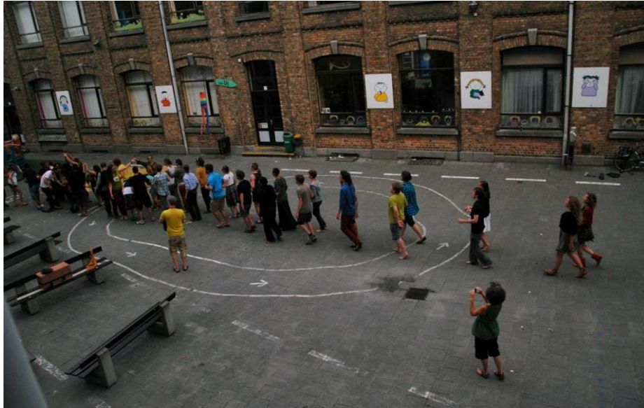
Figure 5: A dance evening on the playground at Ethno Flanders 2013. An Estonian dance with bagpipes