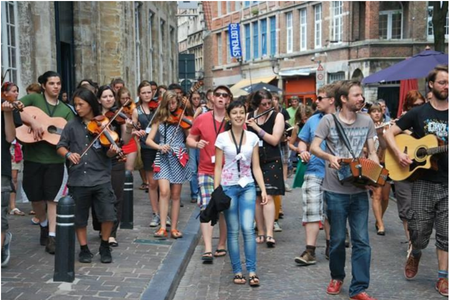
Figure 8: The parade in Ghent

Thus, for example, the surprise excursion to the maritime museum on a boat (see picture above) also had the purpose of promoting new kinds of music making interaction and exchange between participants - in this case, the entire group moving back and forth from one end of the boat to other while playing.