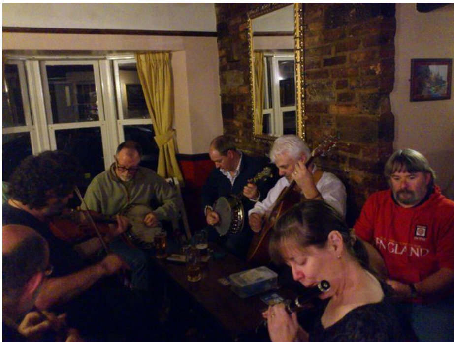
Figure 10: A Monday session at the Elm Tree pub, Durham (October 2011)