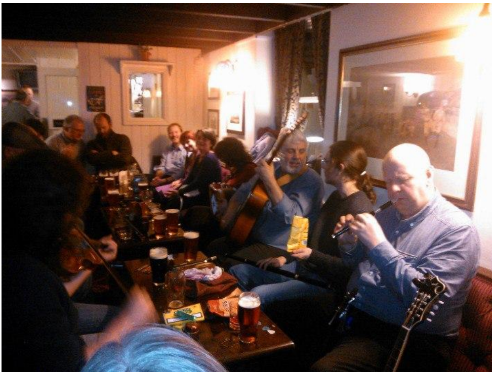
Figure 9: A Thursday session at the Dun Cow pub, Durham (January 2013), with players in the foreground and audience in the background

lines (resulting from each musician interpreting the focal melody in their own way and idiomatically according to their instrument). It is not only locals unfamiliar with session folk music-making who are puzzled by the conventions of session behaviour but, as Kearney underlines, drawing from his experience of Irish music session, tourists are also mystified by the interpersonal dynamics: "[they] wonder at the informality and apparent chaos as the session grows from three musicians to eight or more" (Kearney, 2013, p. 180). Similarly having observed outsiders' responses at sessions, Mackinnon concludes: "because folk music celebrates a 'front' of informality masking a complex rule-governed behaviour, those unfamiliar with sessions can easily misread this type of musical event as an 'anything goes' happening, and cause the session to be disrupted and breakdown" (1994, p. 104).