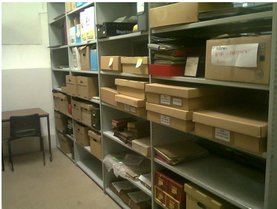
Figure 16: A view of the archives at the Vaughan Williams Memorial Library

daunting to enter such institutions. He made an interesting comparison with the National Census going online, and the huge interest it aroused during the first few days after its release, despite its having been accessible in local archives for several years. For these reasons, digitalising the resources from the Vaughan Williams Memorial Library and making them available to anybody online has become one of the priorities for EFDSS. Several projects have been funded to achieve this goal, the latest to date being "Take 6", as a prolongation of the "Full English Project" to "put [the resources] out there", including pictures and photographs. However, he underlines the difficulty of assessing the real impact of such projects as it is impossible to know both how many people and what kinds of people have been consulting the resources online. Nonetheless, he points out that the library receives positive reactions and feedback from the public, notably in regards to visual resources, when family members contact the EFDSS to identify their relatives in digitalised photographs.