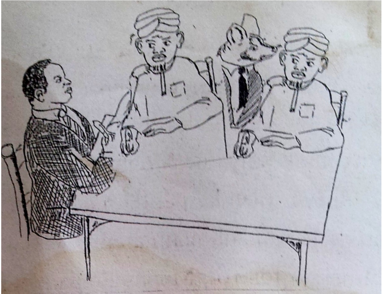
Figure 8: 'Sell-outs at the table with the Arabs' Published in Akut Kuei song book, p. 14.

Detke ke apath koc rec yiecda aa kak. Watch them closely, these are the ones who are spoiling our right.