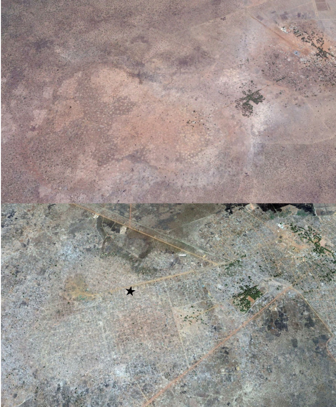
Figure 2: Satellite images of Aweil town Aweil town in 2003 (above) and 2015 (below), showing part of the massive suburban growth of the town. My rented room is marked by the black star.