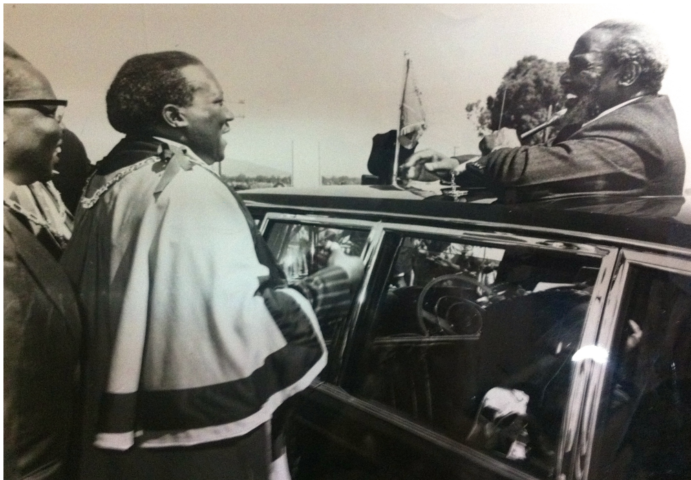
Figure 15: Photograph of Mayor Mburu Gichua welcoming President Kenyatta to Nakuru, 10 March 1976.

'Kiambu elite' was suspected of masterminding this scheme, 'ultimately the plot came to nothing'. 80