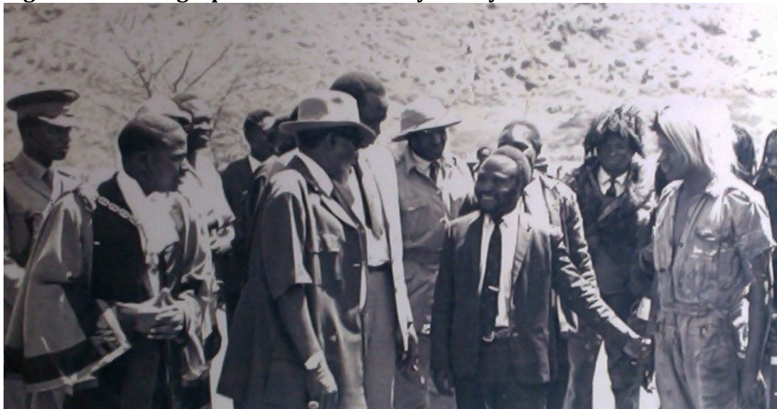
Figure 14: Photograph of President Kenyatta by Lake Nakuru