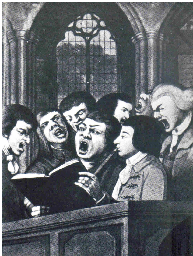
Figure 2: Grimm, Samuel H., Village Choir (1770), print. Available online at http://www.wgma.org.uk/Resources/WG%20in%20Art.htm [accessed 27/09/14].

Evangelical reformers made some attempts to reform parish music - part of their wider project to fight 'irreverence' within the British church. But their impact was slight. Real change only occurred with the emergence of the Tractarian movement during the 1840's. This saw High Church reformers instigate a wholesale reform of parish music.