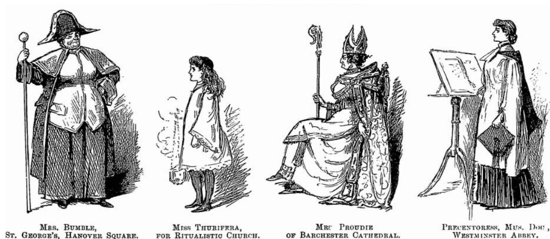
Figure 12 (above): ‘Ecclesiastical Fashions for Ladies’, Punch (28 Sep 1889): 147.

would have published images of women in ecclesiastical costume had there seemed any risk their suggestions might be adopted. The joke would have faced too great a risk of misinterpretation. The sense, then, was less ‘we may as well have lady clergy...’ and more ‘we may as well have lady clergy!’