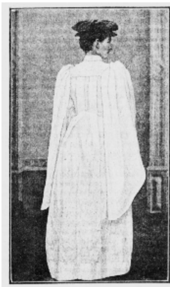
Figure 11: Rear view of one of Wilkinson's robed female choristers. 'Lady Choristers', MH (1 Sep 1889): 197.

appear before a congregation. Depicting the female chorister as 'angel of the house' was ironically a means of legitimizing female presence outside the domestic sphere.