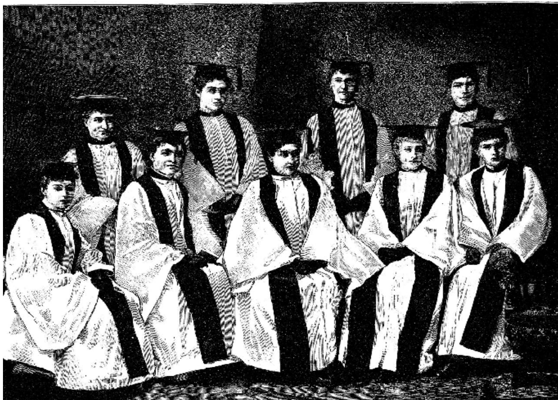
Figure 6: 'An Australian Innovation in the Church Service: "The Angelic Choir" at St. Paul's Pro-Cathedral, Melbourne', The Graphic , 7 Sep 1889.

Robed female choristers arrived in England the following year. First on the uptake was Rev. Willoughby B. Wilkinson, officiant at St Luke's, Birmingham. In many ways, Birmingham was a surprising setting for choral innovation. As noted in Chapter One, the city was strongly committed to surpliced choirs. As early as 1870, 50% of Birmingham churches had instituted the surpliced model, compared to 21% in greater London. 6 By the 1890s, the city had one of the lowest percentages of female singers in the country: 12.5% compared with 25% nationally. This was a city with a particularly strong attachment to orderly, surpliced, and above all male choirs.