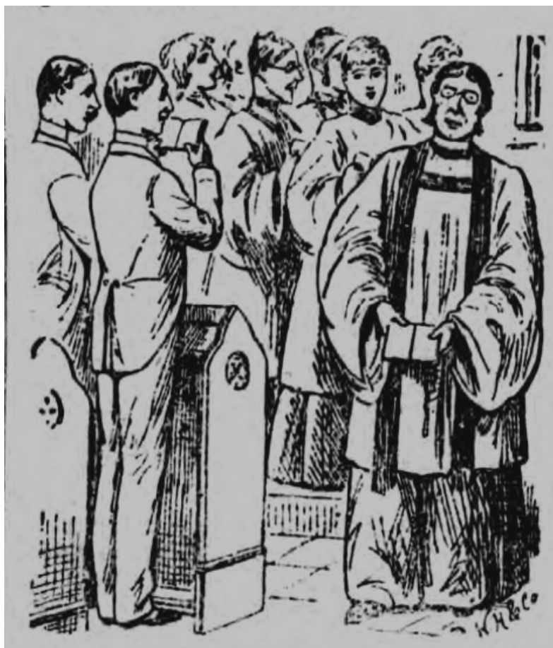
Figure 9: A robed female chorister exchanges a glance with two men in the congregation. 'Notes', The Burnley Express , 7 Sep 1889.

Evidence from earlier discussions of female choristers shows that Hodgson's diagnosis was no exaggeration. Writing a satirical account of the 'woman versus boys' debate as a historian from the year 2869, William Glover cast dress as a central issue: