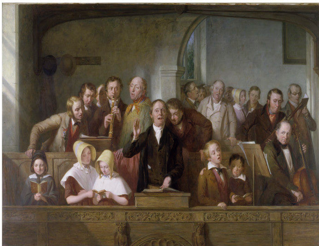
Figure 1: Thomas Webster, A Village Choir (1847), oil on panel. Victorian and Albert Museum, London. Available online at < http://www.vam.ac.uk/users/node/937 > [accessed 27/09/14].

1870, 'the employment of female trebles in our churches was almost universal'. In 1889, another Standard correspondent declared that the 'substitution of boys' voices for those of women' was 'not one of the least important changes' that had recently occurred in Anglican music. 15 Of course, it is worth bearing in mind that these accounts generally came with an agenda – either celebrating or denigrating mid-Victorian reforms. Even considering possible exaggeration, though, the sources indicate that women and girl singers were relatively common at least until the early decades of the nineteenth century – a time well within the living memory both of these authors, and of their audience.