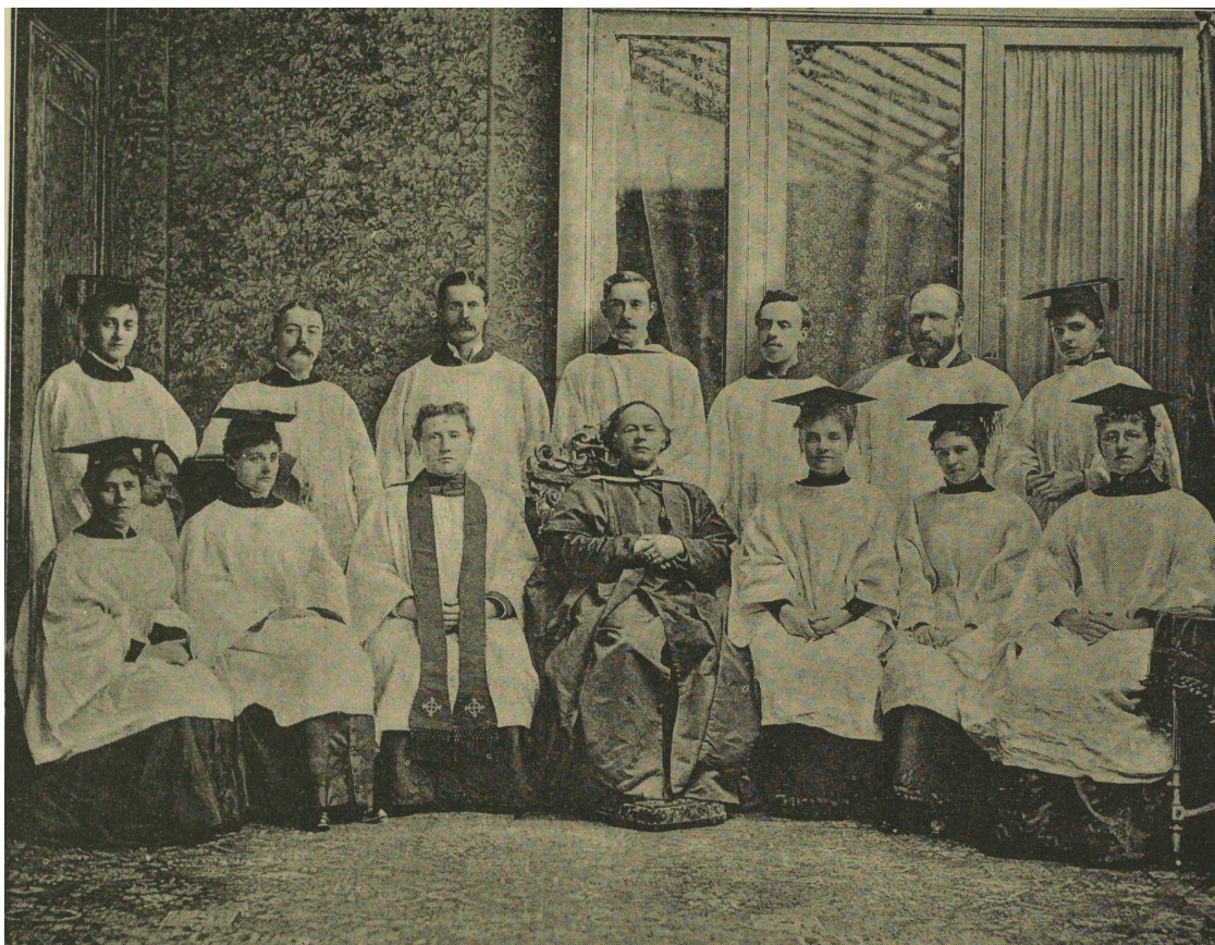
Figure 7 (above): 'The Reverend H. R. Haweis and his Mixed Choir', ILN 2783 (Aug 1892): 242.