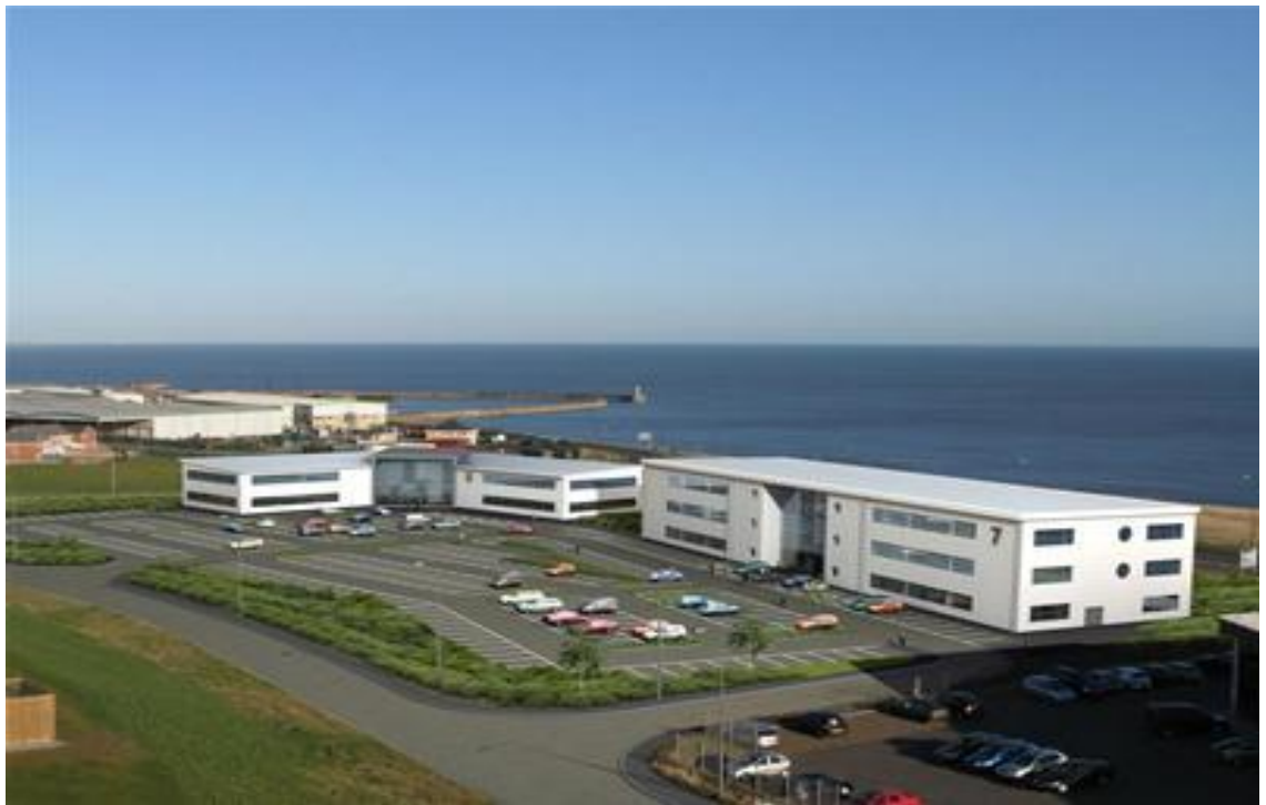
Figure 4 (above): Seaham Spectrum Business Park; Enterprise Zone in East Durham

Situated 6 miles south of the City of Sunderland and 13 miles east of Durham City, the town of Seaham owes much of its history to the port (Seaham Harbour) which