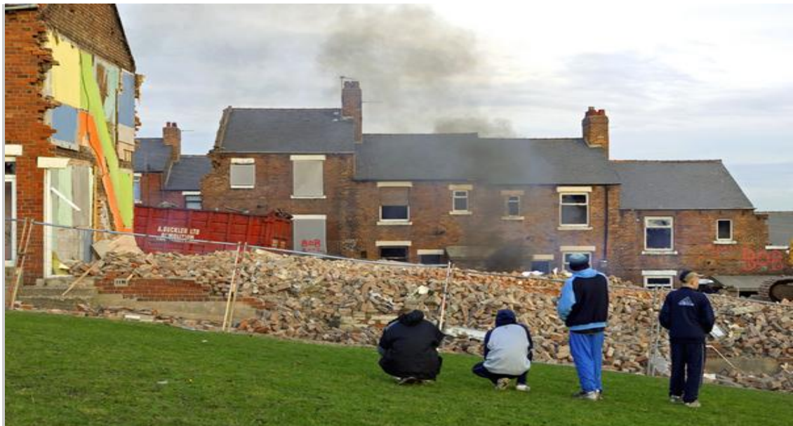
Figure 10: Demolition of Andrew and Alnwick Street ('B' Streets), Easington Colliery 2003.

measures are required to solve the problems associated with pit closures and the mass selling of colliery housing which, it was argued, was carried out with a lack of forethought for the community. this process meant that housing and the physical fabric of the community deteriorated, leading to redlining when the majority of housing developers rejected Easington Colliery as a neighbourhood to build properties in both slump and boom housing market periods. Evidently-- and supporting Smith's theory-- this resulted in the abandonment of properties, which created numerous void and vacant dwellings, some of which were subject to demolition (see figure 10, below) as part of the housing market restructuring of East Durham.