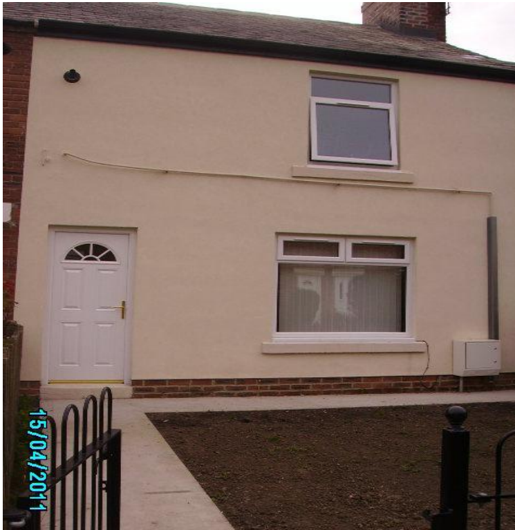
Figure 11b: An example of Group Repair work in Wembley, Easington Colliery: Noble Street after Group Repair

Overall the research uncovered support for Group Repair across a range of respondents. There was a general consensus that the programme was effective, providing some “absolutely fantastic examples across the county” (BB) in pre 1919 stock. As such it was regarded as a valuable policy which not only improved the aesthetics of the physical environment but also influenced the perceptions of the area making the houses and wider neighbourhood more attractive to potential and current residents. This is a subjective notion however as a lack of data on the specifics related to the scheme, i.e. empty homes, meant that it was impossible to categorically state that group repair had improved “let-ability” in the targeted areas- a point highlighted by a local authority housing specialist (Interview FF). The focus of the scheme on the physicality of the neighbourhood promoted most discontent. A local councillor who suggest that face lift programmes are “all well and good” but believe a more strategic approach is needed to “tidy up the colliery” which should focus on “bring[ing] in better housing” (Interview P). One such interviewee suggested that Group Repair focuses too much on the aesthetics of the