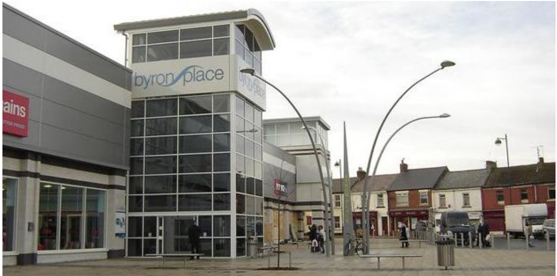
Figure 3 (above): Seaham Byron Place Shopping Centre