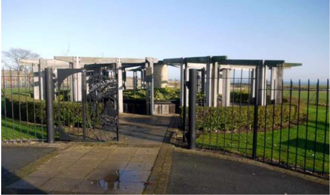
Figure 9 (above): the entrance to the former pit site, Easington Colliery, in which a small commemorative garden has been erected to the miners of the colliery

Easington Colliery today has a population of approximately 5,000. Low levels of earnings, low aspirations, low skill levels and poor health have created, according to Durham County Council (2010), a neighbourhood with high levels of multiple deprivation- with 18% of the population of working age claiming incapacity benefits, and the majority of houses falling within Council Tax band A (DCC, 2010 Private Sector Housing Strategy For County Durham 2011- 2015, draft). Easington Colliery, along with neighbouring mining areas of Wheatley Hill and Dawdon, is a focus for housing renewal work on existing housing stock in East Durham - identified as 'regeneration hotspots' by Durham County Council during the local government restructure in 2009 (Interview D). Interestingly these villages are not those which were marked out as 'Category D' settlements 7 in the 1951 Durham County Development Plan (see Chapter 2).