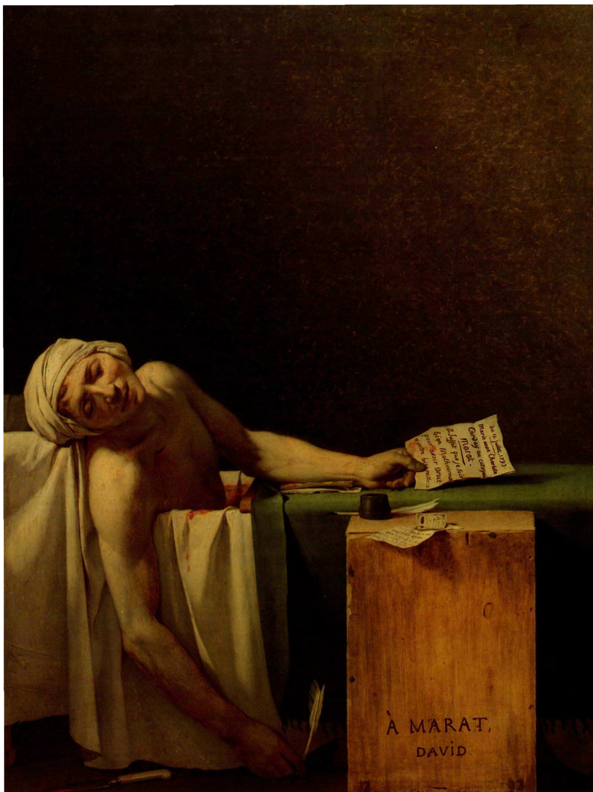
Jacques-Louis David's La Mort de Marat , 1788