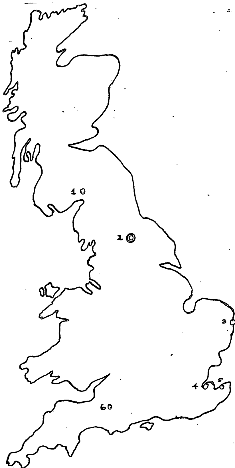
MAP 7. ROMAN COIN-JEWEL DISTRIBUTION.